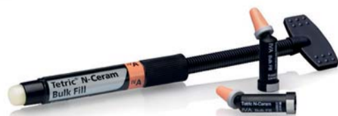
Tetric® N-Ceram Bulk Fill sculptable

* Compared with Tetric® N-Flow and Tetric® N-Ceram. Data available on request.