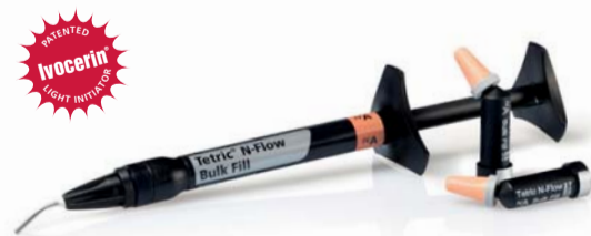
Tetric® N-Flow Bulk Fill flowable