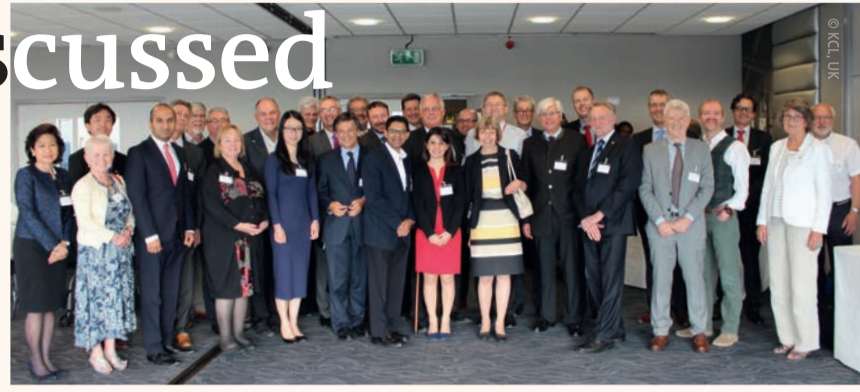
Over 50 dental stakeholders attended the meeting in London.

While its use in developing countries is declining, the mercury-containing restorative remains the material of choice in developing countries around the world.