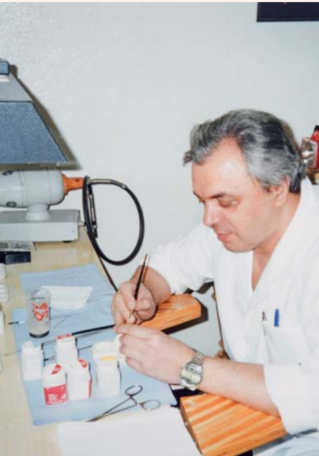
Now proven to be carcinogenic, asbestos used to be a common part of some dental production processes in the 1960s and 1970s.

malignant mesothelioma, a type of cancer that most often affects the pulmonary pleurae and less commonly the peritoneum.