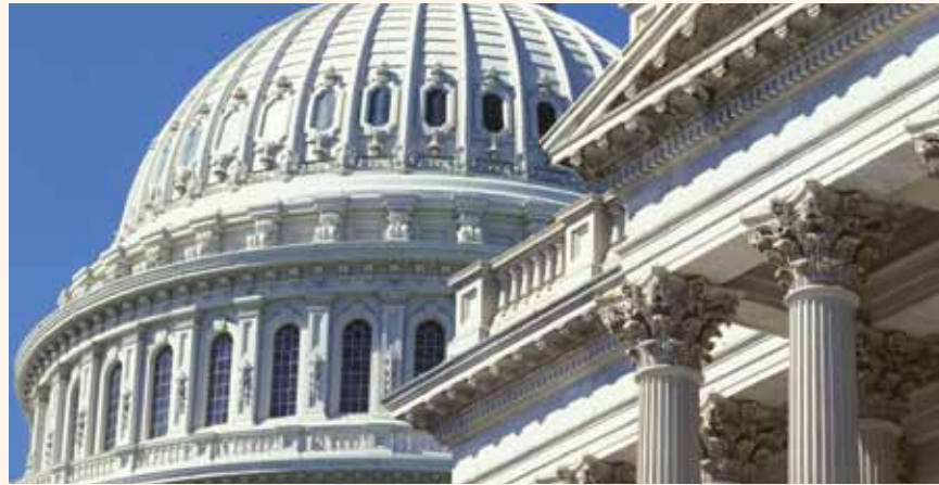
Financial services reform legislation being debated in Washington could hurt dental practices, according to the ADA and other dental associations.

As currently written, the Restoring American Financial Stability Act of 2010 would subject health care providers who regularly charge interest on outstanding bills or allow patients to pay in installments to federal scrutiny.