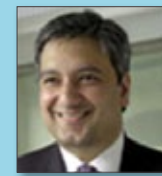
RAJ RATTAN: (1.5 hour) Dental Protection Legal & Ethical Challenges & Solutions