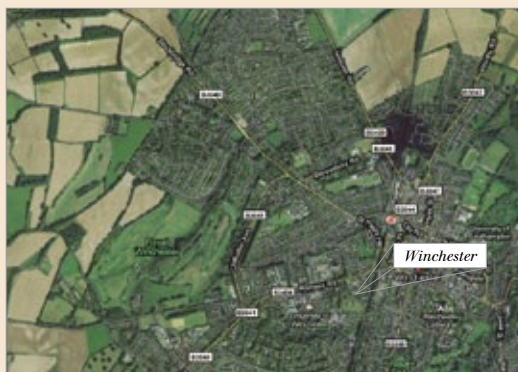
Hope of a new NHS dental surgery in Winchester

"Once the contract is awarded, we will be in a position to make more information available, and then we will start to take the details of people who want to register. In the meantime we would encourage anyone seeking an NHS dentist to check Hampshire Dental Helpline on a regular basis as details of availability across the whole of Hampshire are frequently updated."