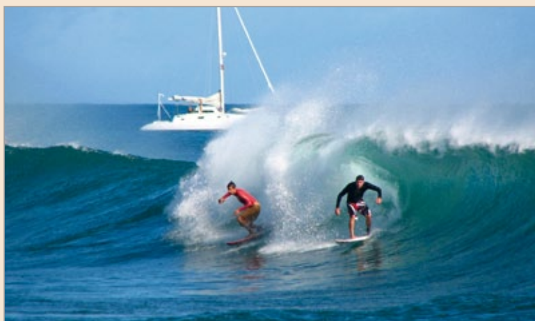
Surfing the first wave of practice pilots of the Steele review recommendations

Different methods of delivering these recommendations will be piloted thoroughly over the next two years to ensure they meet the needs of the NHS and patients, but the flexibility of the