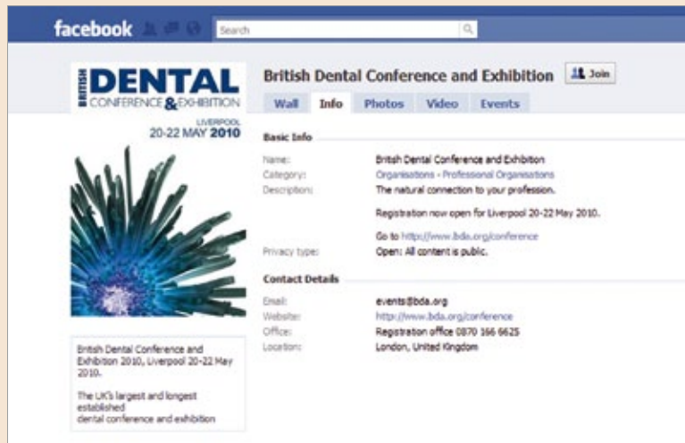
Facebook website with the new group called 'British Dental Conference and Exhibition'