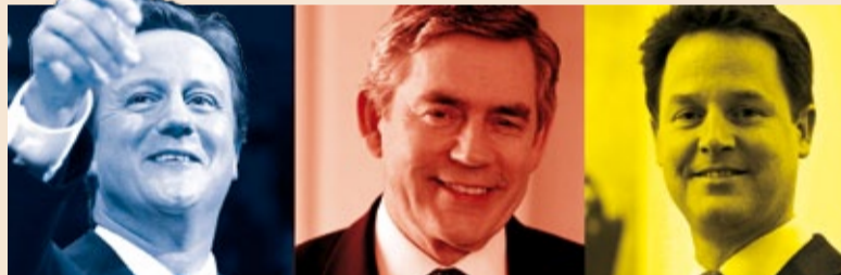
Any takers? Cameron, Brown & Clegg in leadership battle

Ministerial Health team decimated by lost seats, lack of clear outcome leaves both dentistry and country in limbo