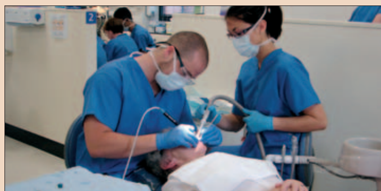
Students will carry out emergency care, including scale and polishes, fillings and simple tooth extractions.

Their clinical training will be supplemented by further lectures, some via video links with the School of Dentistry in Preston, Lancashire. ■