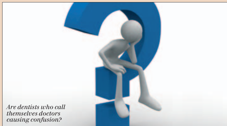
Are dentists who call themselves doctors causing confusion?