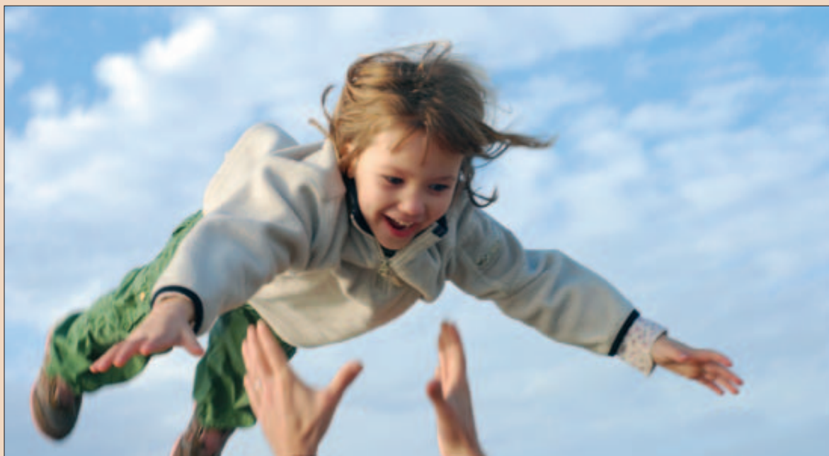
You have to strike a balance in your life

Everything in life is a balancing act, including deciding what kind of practice setting will make for a satisfying dental career. For some, the choice of solo practice offers advantages over a group or academic setting.