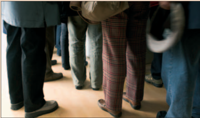
There are thousands of Scots unable to access NHS dentistry