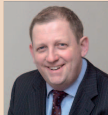
'The figures don't tell the whole story'

Figures for dentists' earnings and expenses for 2006/07 which were published earlier this month do not paint the whole picture, claims the British Dental Association. (BDA)