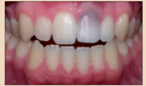
Tooth-whitening is one of the FGDP's aesthetic dentistry masterclasses.

Members of FGDP (UK) get a 10 per cent discount when purchasing all five modules.