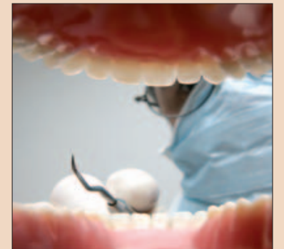
Lincoln patients are set to benefit with NHS dentistry

The challenge now is to get the message across to residents that dental access has greatly improved, with regard to NHS dentistry in the locality.