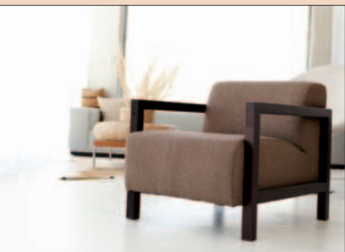
Don't ignore your chairs

Furniture can also be used to create and project your practice's chosen image. The type of furniture you choose will give a certain atmosphere to a room. For example, choosing clean, modern furniture can create an uncluttered, contemporary and airy ambience. So it's good to explore the options before you buy, and think about what kind of mood you like to set.