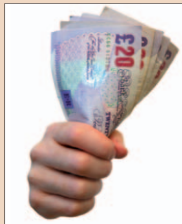
Dentists have received a 13 per cent pay rise

Official figures compiled by the NHS Information Centre are set to reveal that on average an NHS dentist earns a six-figure salary. The figures show that dentists across the UK received a 13 per cent pay increase