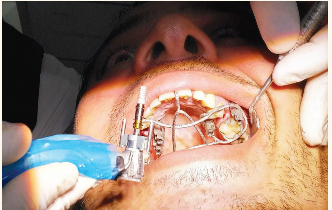
The open design of the guide gives great visibility and allows cooling

Our primary product line remains PFM crowns and bridges. However, since we last met, we have introduced two new products: Removable Partial Dentures and Metal Surgical Guides. The RPDs which we produce are a great solution for a partially edentulous patient who is not a candidate clinically or financially for implants. We use a metallurgical process called Solution Annealing which brings flexibility into our metal and helps with the fit for the patient. The second product is a metal 3D printed Surgical Guide. This is a really exciting innovation in Surgical Guides and we recently collaborated on a trial surgery to test the product in the Middle East region for the first time.