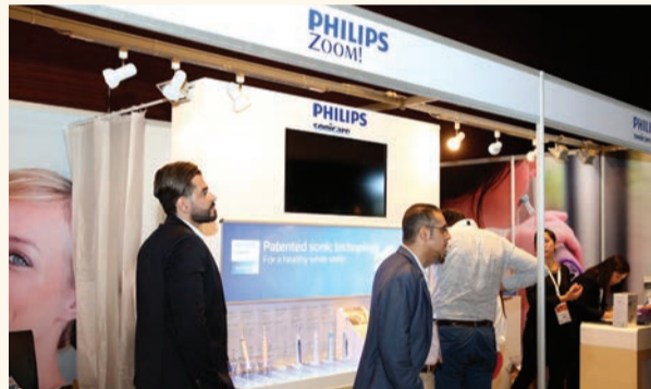
Gold Sponsor Philips presented once again Philips Sonicare and Zoom as part of its portfolio