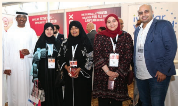
Delegates from Ministry of Health and Emirates Dental Society