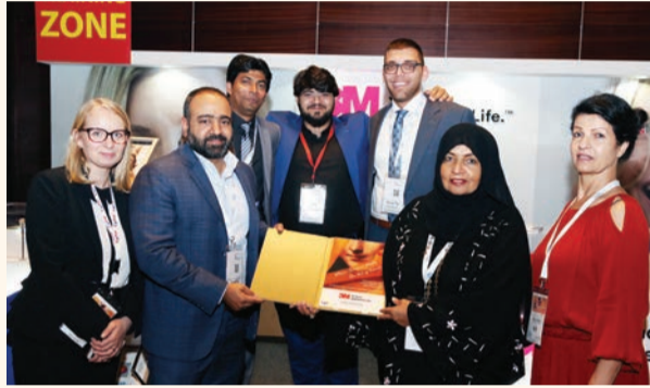
Gold Sponsor 3M received several dozens of delegates at their dedicated training zone at the booth