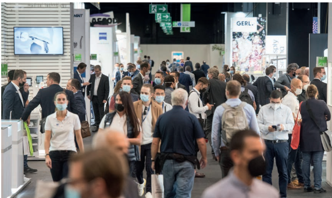
•In 2021, 23,000 visitors from 114 countries attended IDS.

After COVID-19 slowdown, IDS set to return to its former size for anniversary event.