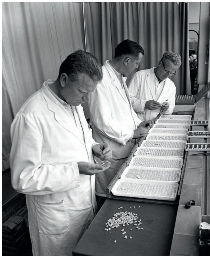
•Visual quality control of ceramic crowns after final firing.

The company headquarters, which are now in Liechtenstein, were originally in Zurich in Switzerland, where the company was founded in 1923.