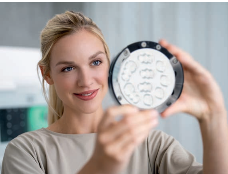
◀IPS e.max ZirCAD Prime delivers a superior level of quality and high-end aesthetics in zirconium oxide restorations.

The dental company maintains long-standing and trusting business partnerships with suppliers, customers and universities throughout the world. They are just as instrumental to fulfilling the company mission of “Making People Smile” as the employees of the family-owned business are. In the 2023 anniversary year, everyone can look forward to a series of special activities and events highlighting and celebrating “A Century of Innovation”. Among these will be trade fair showcases and further education and