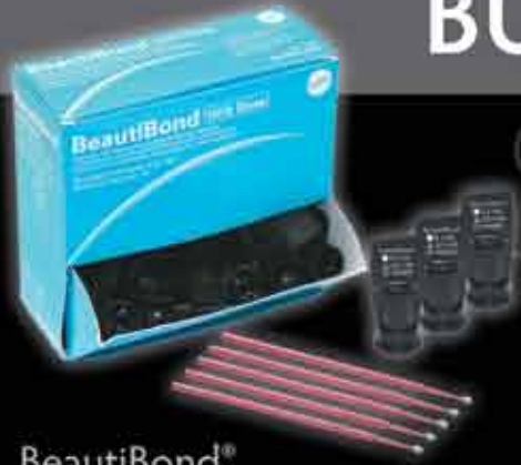
BeutiBond® One Adhesive: Two Powerful Monomers