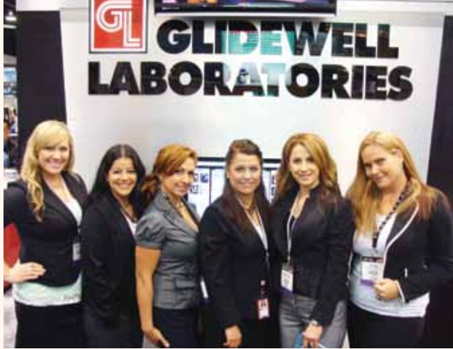
The team members at Glidewell Laboratories (booth No. 1444) are all smiles.