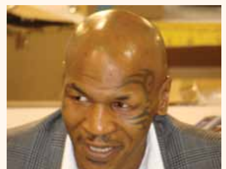
Mike Tyson was signing boxing gloves on Friday at the Glove Club (booth No. 832).