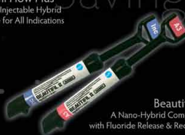
Beautifil® II A Nano-Hybrid Composite with Fluoride Release & Recharge