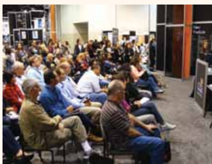
The Spot is a great place to sit down and relax — and learn something at the same time.