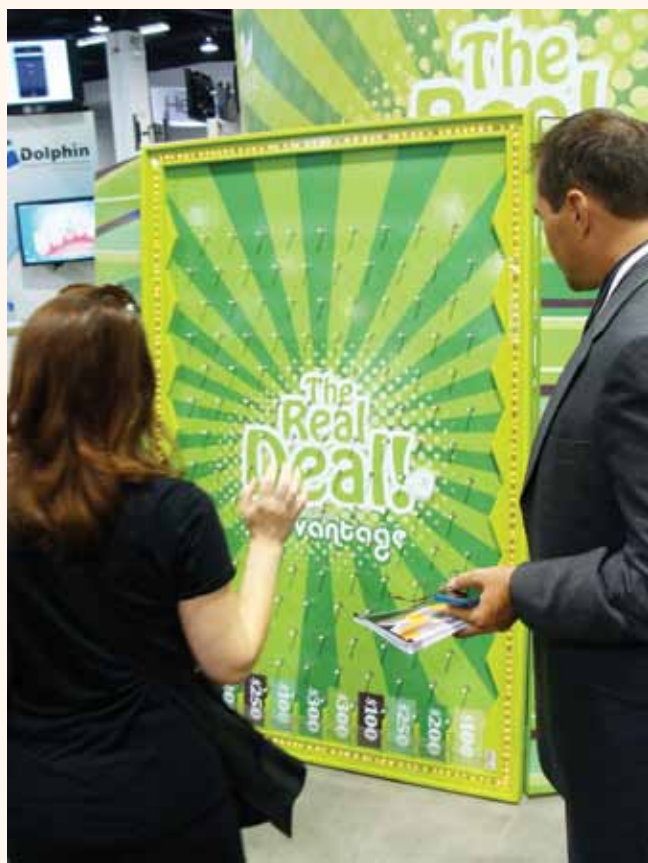
Those who are enrolled in the Advantage Program with Patterson Dental Supply can stop by the booth (No. 434) to play a Price-Is-Right-style game.