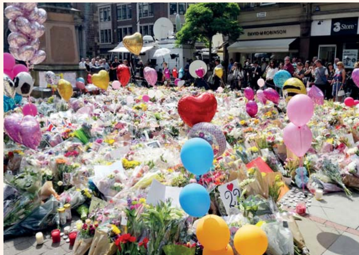
Floral tributes at St Anns Square in Manchester. The attack has left 22 people dead and over 50 injured.

"Quite rightly Manchester has resolved to carry on. Our thoughts are with all the families touched by this atrocity," he added.