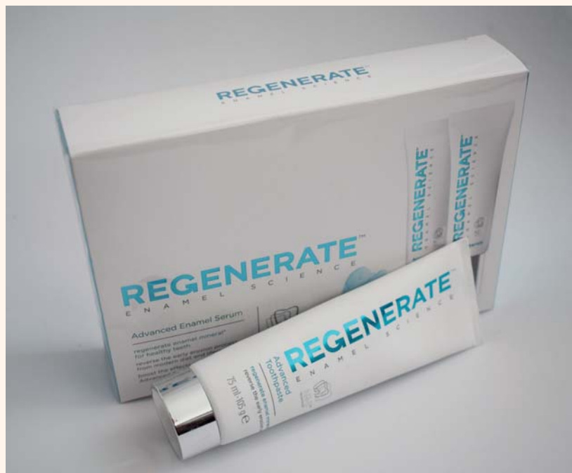
The new REGENERATE serum complements the toothpaste with the same name.

emerged with the increasing consumption of soft drinks and acidic foods that are sold to millions in supermarkets and corner shops throughout the country every day.