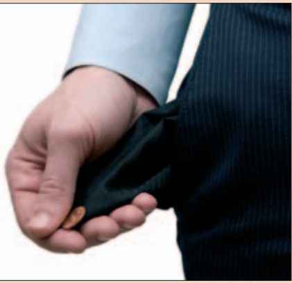
Dentists are having to pay back £120m

The 'botched contract' is forcing dentists to give back £120m to the NHS because they have fallen short of targets agreed with local health authorities.