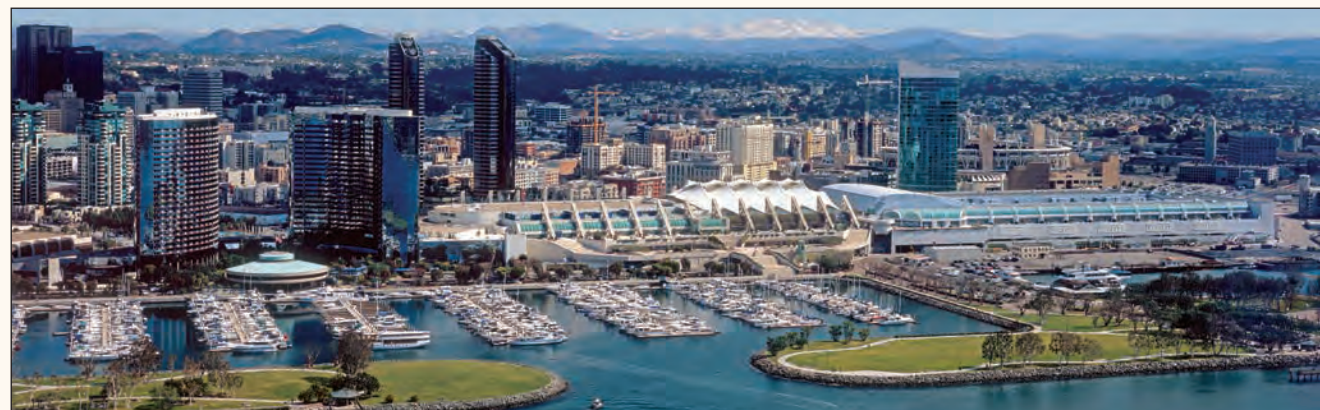
The San Diego Convention Center, on the city's waterfront and a short stroll away from the city's popular Gaslamp Quarter, is host site of the American Academy of Cosmetic Dentistry 2019 annual scientific session, April 24–27.