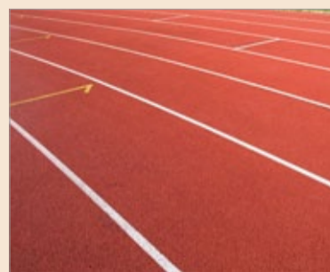
Sport courses in dentistry

The course may be taken as either an optional module