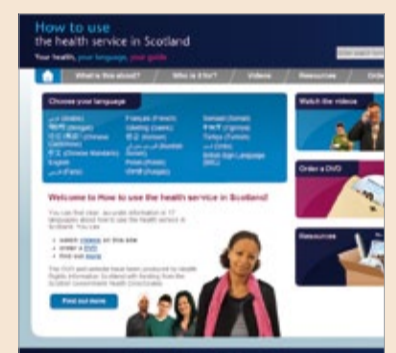
How to use the health service in Scotland website

Nicola Sturgeon, the Cabinet Secretary for Health & Well-being said: "Our aim is to put patients at the heart of the NHS and make them partners in