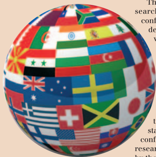
All 14 institutions were recognised

The 2008 Research Assessment Exercise was conducted jointly by the Higher Education Funding Council for England, the Scottish Funding Council, the Higher Education Funding Council for Wales and the Department for Employment and Learning, Northern Ireland. □