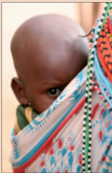
Dentsply supplied free dental equipment to aid Kenya

A spokeswoman for Dentsply said: 'Our donation of dental instruments, particularly the new Artio range, as well as other equipment, helped to make the expedition possible.' □