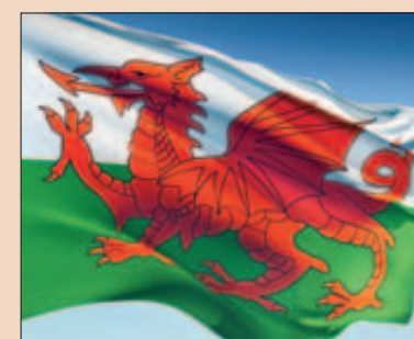
New regulations could affect private dentistry in Wales

He said: 'This is unnecessary regulation on top of existing rules, it is over the top. This could put dentists off coming to Wales