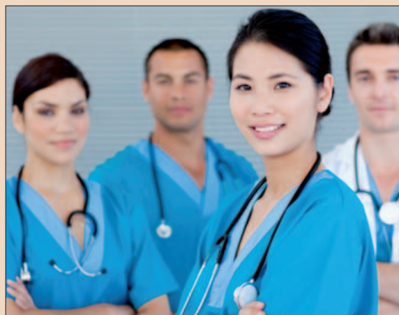
Health care spending has improved in Asia but still is below average.

The US currently spends more on health care than any other country—almost two and a half times greater than the OECD