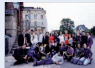
Participants at the 44 th EDSA Meeting in Helsinki, Finland

The European Dental Students' Association (EDSA) was founded more than 21 years ago in Paris and now has a reliable network of more than 65,000 dental students from 182