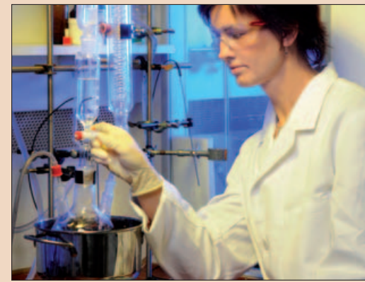
A researcher produces laboratory samples based on the new material.

ORMOCERS are already used in optical functional coatings for glass and ceramic components and easy-to-clean coatings for metals and leather. According to ISC officials, a final product for dentistry will be launched in a few years. DTI