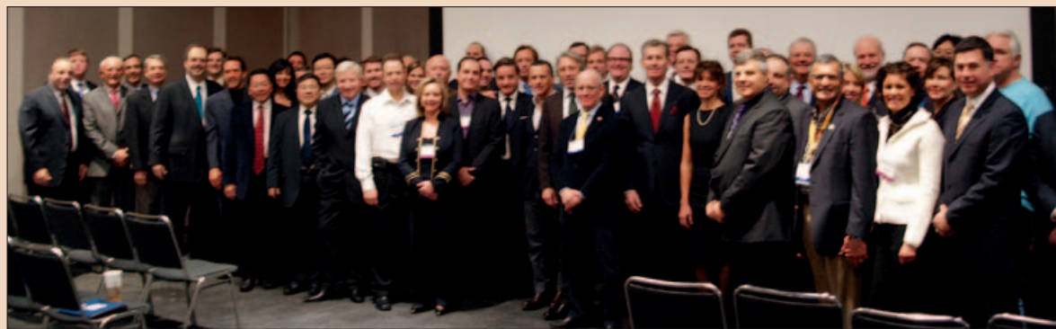
Members and Associates of Dentcubator gathered in New York.