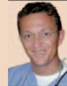
Dr Carsten Appel Germany

Endodontic therapy is often the last opportunity to preserve a natural tooth. If a tooth has a sufficient restorative and periodontal prognosis and the necessary endodontic treatment is done properly, the longevity of patients' teeth can be extended to decades. There is ongoing debate comparing endodontics and implants as therapy alternatives. Yet, there seems to be a tendency towards the replacement of natural teeth with implants, sometimes even in cases in which the tooth could have been preserved.