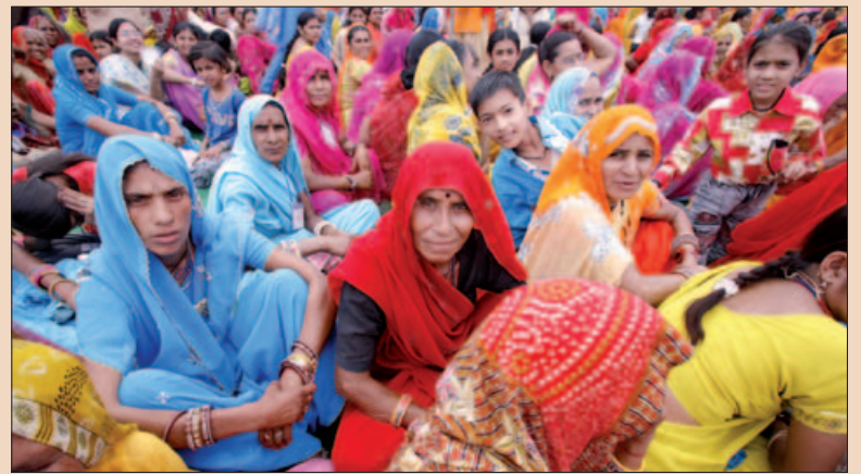
Gathering of brahmin woman during a wedding in India.