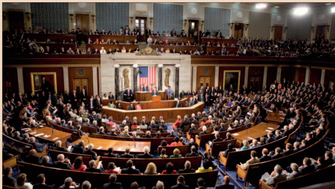
President Barack Obama delivers a health care address to a joint session of Congress.

Dental caries is one of the most prevalent health problems in the US, and disparities in oral health are evident across ages. A report by the US National Maternal and Child Oral Health Resource Center states that although more than 90 per cent of general dentists in the US provide care to children and adolescents, very few provide care to children under four. Amongst children and adolescents from