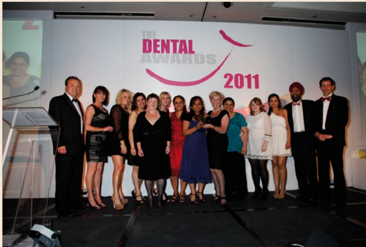
Team of the year - Sweetcroft Dental Care

Winners announced for national dental competition