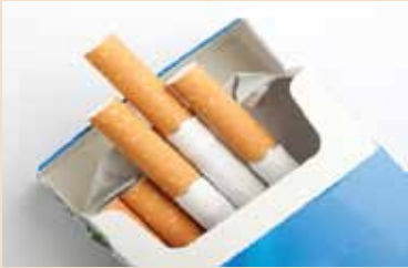
Can I see your ID please?

“We know that tobacco dependence can begin very soon after a young person first tries smoking so it’s critical that we stop young people from smoking before they even start,” said Bloomberg. DT