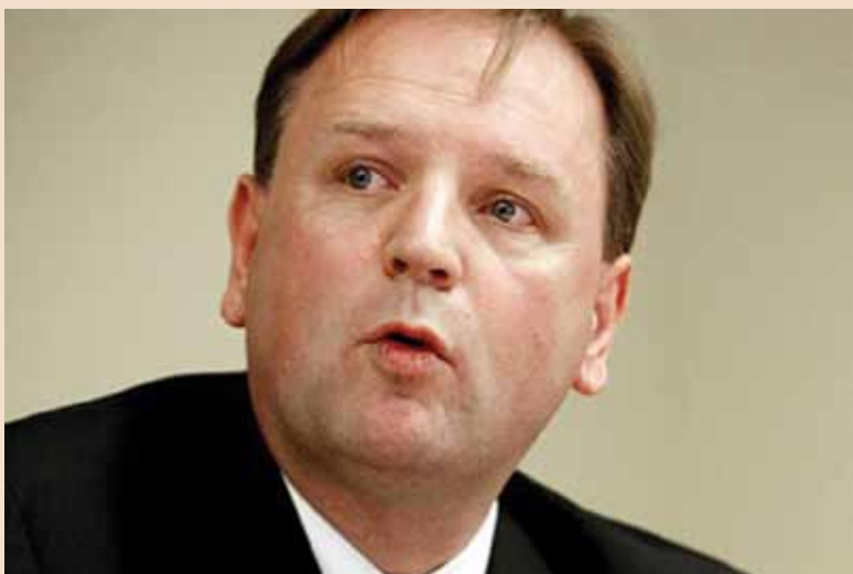
Pictured: Simon Stevens.

Simon Stevens, a senior executive at a private US health firm, has been ap-