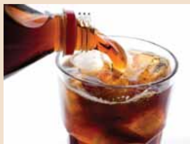
Taxing fizzy drinks call

A 20 per cent tax on sugary drinks could reduce the number of obese adults in the UK by 180,000.