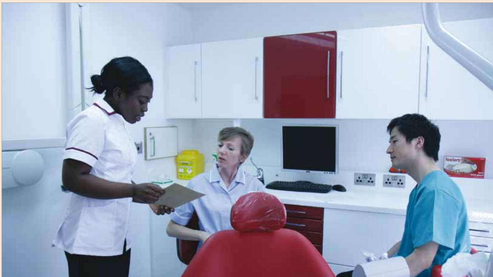
Are nurses getting the best deal when it comes to cost?