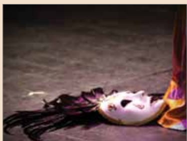
The MyFaceMyBody Awards has been organised to celebrate and award those who have made a difference in the cosmetic sphere

The aesthetic and dental business is one of the most forward-looking industries in the world. It is constantly pushing the boundaries of what is possible to achieve and matches technological advances with human endeavour to create stunning solutions which change people's lives for the better.