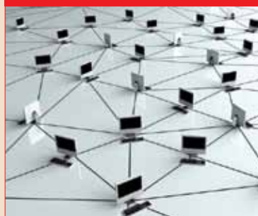
Facebook flop Rita Zamora provides some real life examples