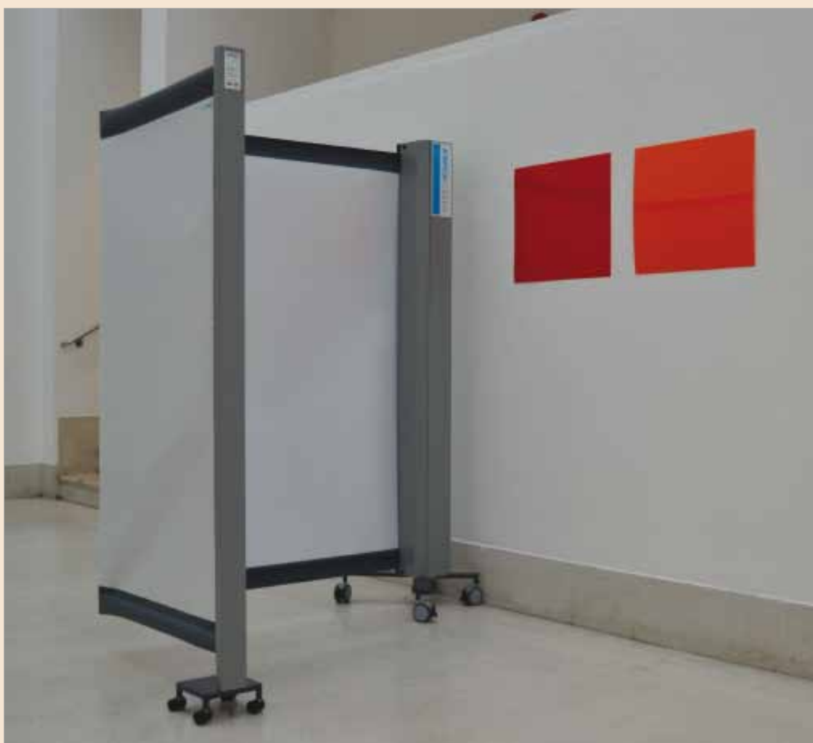
Kwick screen bent

“It’s very flexible – you can screen off areas at right angles, double back on themselves and you can split a