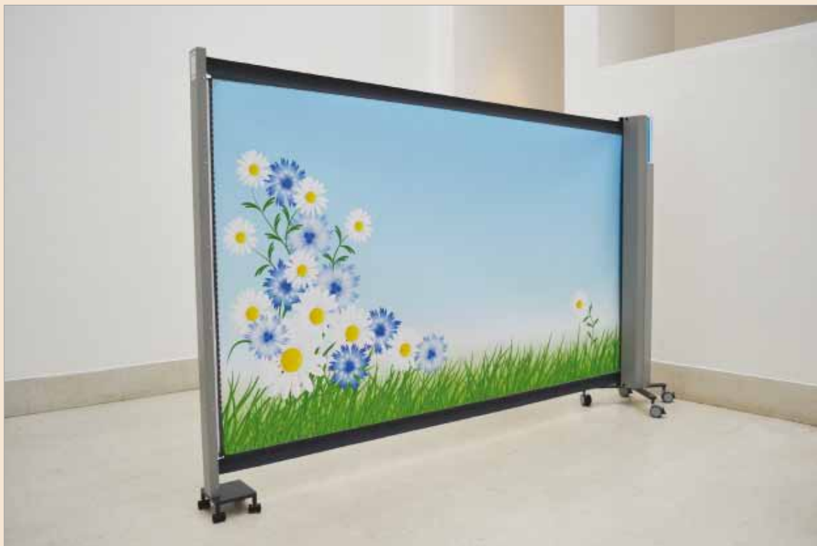
Kwick screen with floral print