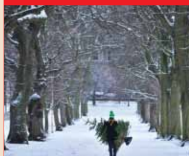
Christmas nightmare The Benevolent Fund calls for support