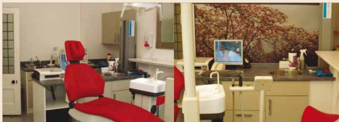
Kwick screen in dentistry

Apart from the contamination and space boxes that the KwickScreen ticks, the