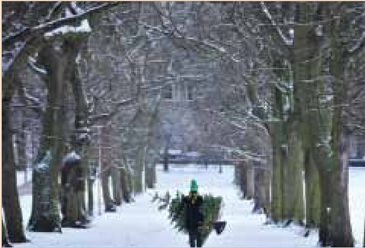
The Benevolent Fund aims to help out dentists in need

All enquiries are considered in confidence. The BDA Benevolent Fund is a registered charity no 208146 DT