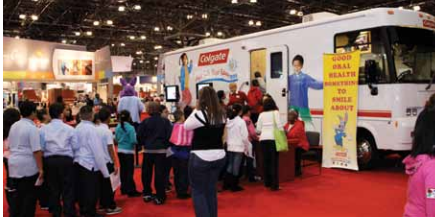
• New York public school children enjoy the Greater New York Smiles Children's Program on Monday, which aimed to instruct and demonstrate the importance of oral health care to local youth.