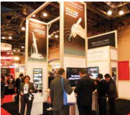
• Attendees have been flocking to the DentalVibe booth (No. 5033) for good reason. The system, which allows for comfortable and predictable injections, is available for $300 less than its regular price at the GNYDM.