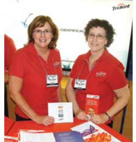
• Get your sugarless gum at the Trident booth (No. 5604).