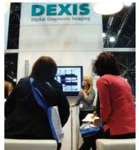
• Meeting attendees learn more about Dexis during a presentation at booth No. 4007.