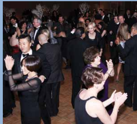
• The Greater New York Dental Meeting's annual Dinner Dance took place Saturday evening at the New York Marriot Marquis Hotel. The black-tie event featured cocktails, dinner and dancing with music provided by The Ultimate Entertainment.