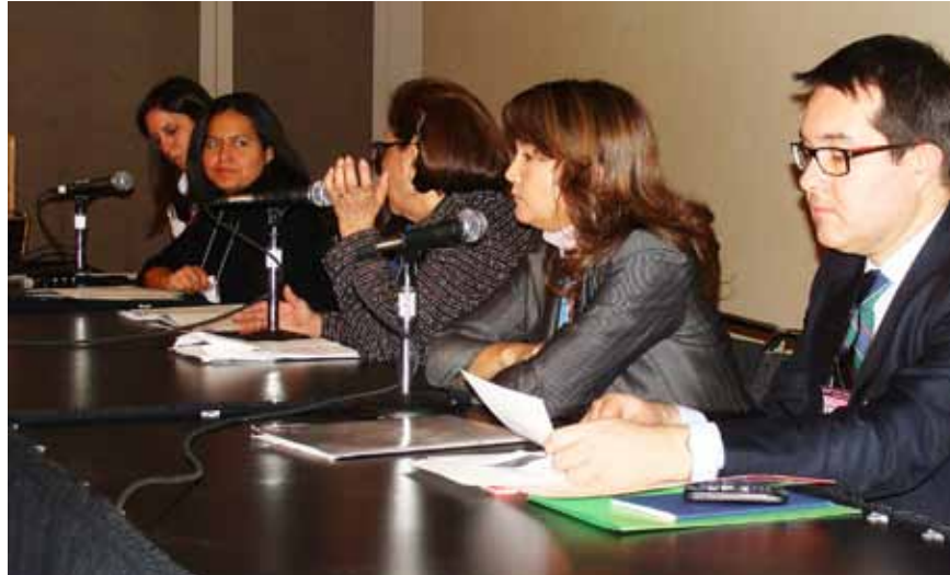
• International Commercial Specialists discuss exporting during a Monday seminar sponsored by the United States Department of Commerce.

As a special feature of the meeting, the international business center meets the needs of manufacturers and dealers who are interested in exporting their products. It is located in the registration area of the Jacob K. Javits Convention Center and is open during registration hours.