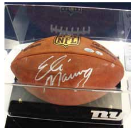
• Find out how you can have a football signed by Eli Manning at the Aseptico booth (No. 807).