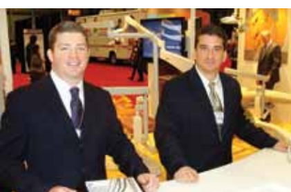
• Attendees have been flocking to the DentalVibe booth (No. 5033) for good reason. The system, which allows for comfortable and predictable injections, is available for $300 less than normal at the GNYDM.