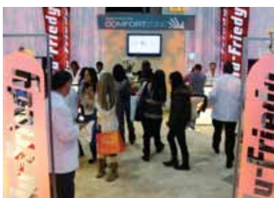
• Step into the "Comfort Zone" at Hu-Friedy Mfg. Co. (booth No. 1403).