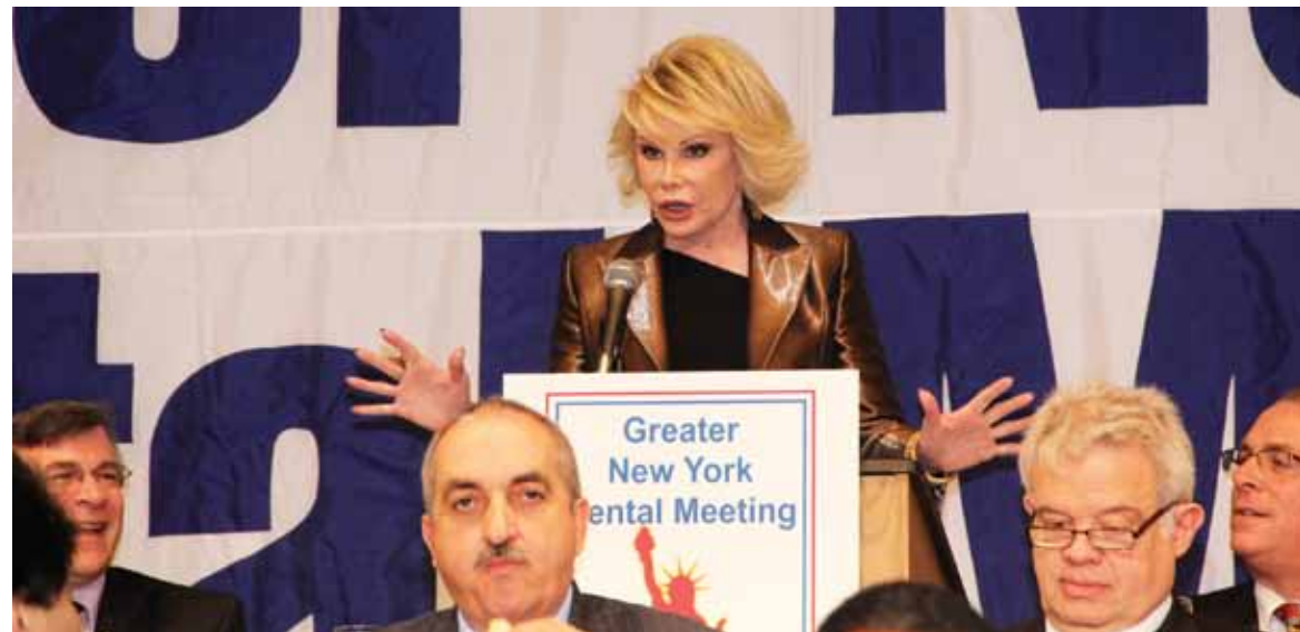
Joan Rivers speaks during the Celebrity Luncheon on Monday.