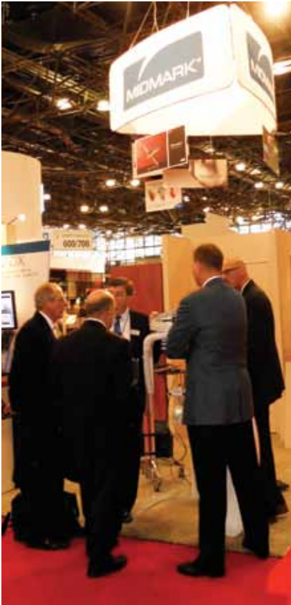
• GNYDM attendees gather around the Midmark booth (No. 217) to admire the lush seating.