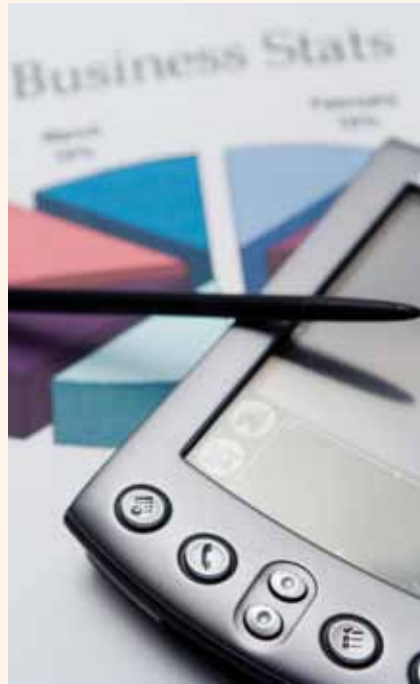
Computer reports are designed to help a practice avoid theft problems, but that means someone has to read them.

Preventing theft by computer requires a thorough understanding by the dentist of the security features built into the office's software. This information must be carefully reviewed with the software vendor's support team to ascertain that access