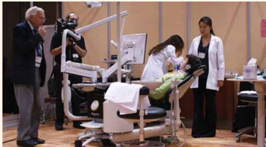
A live dentistry presentation during last year's Greater N.Y. Dental Meeting. Get the full story on the Live Dentistry Arena and what to see and do in NYC.