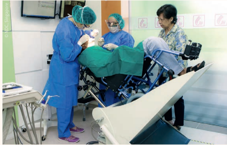
Wheelchair-bound patient being treated on wheelchair titling unit.

The National Dental Centre opened the clinic in response to Singapore's rapidly ageing population and growing demand for these services. Customised for health conditions that are not easily managed at primary care clinics, the special needs unit has wider walkways, larger waiting areas and dental chairs, as well as handrails and low counters. More-