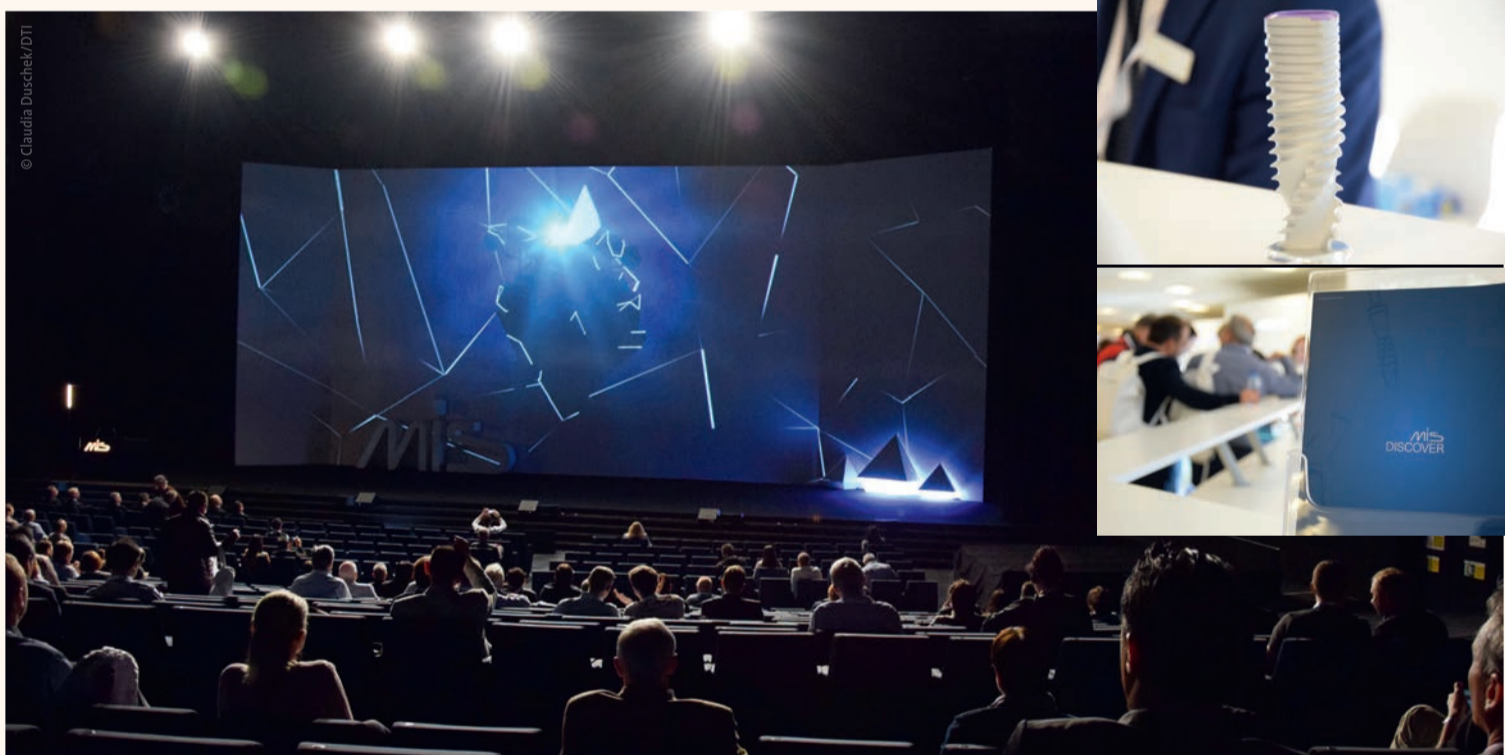
MIS Implants Technology presenting its new B+ implant surface treatment at its Global Conference in Barcelona.