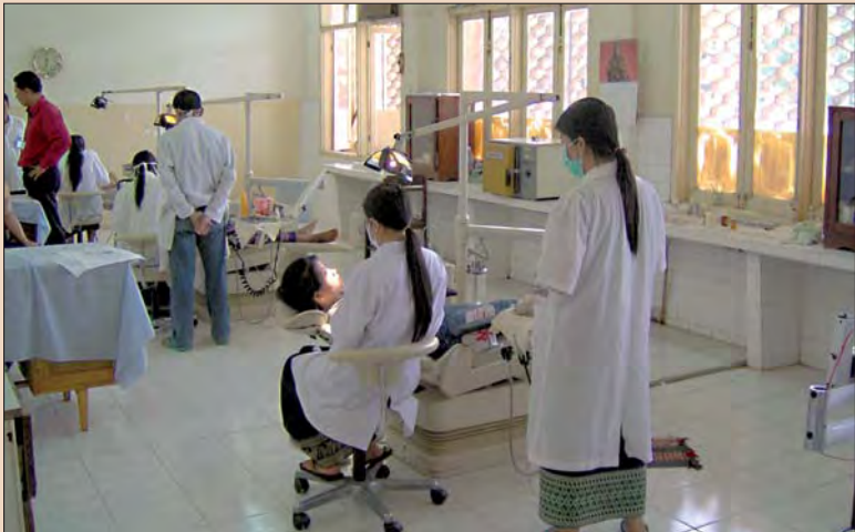
Students during their training at the Laos Faculty of Dentistry.

Upon delivery, a Dentaid engineer will provide on-site installation and train a group of technicians in the servicing and maintenance of the equipment. DTI