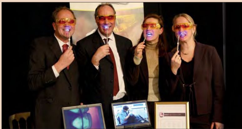
Representatives from Inspektor and the University of Liverpool show the new device at the Medical Futures Award in London last year.