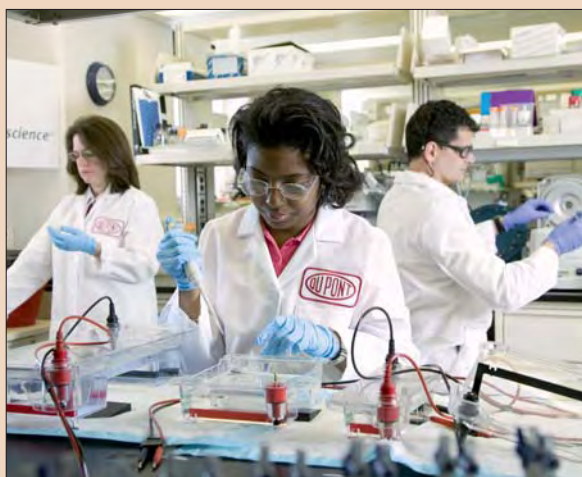
DuPont research scientists at work in a biobutanol molecular biology lab.