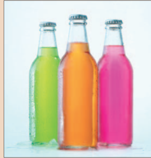
The BDHF is calling for a ban on sugary drinks and snacks

The National Institute for Health and Clinical Excellence, which produces guidance for the health service in England and Wales, has also recommended the promotion of healthier food in surgeries and hospitals. DT