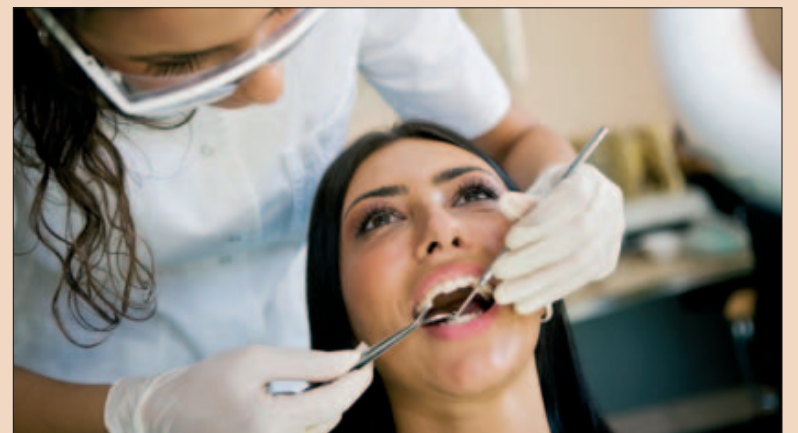
Dentists will get rewarded for preventative work

Fluoride is currently added to children's milk in 42 primary schools in the city and this will continue under the new strategy. D