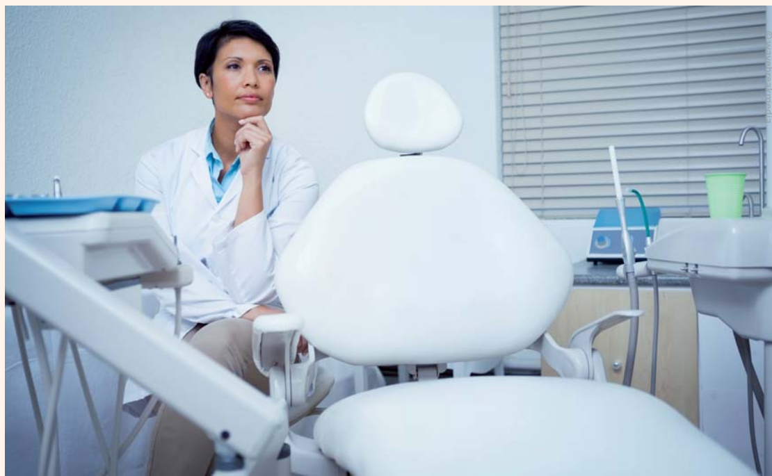
One in two dentists would not recommend dentistry as a career.

"There are huge stresses in the dental profession and great un-