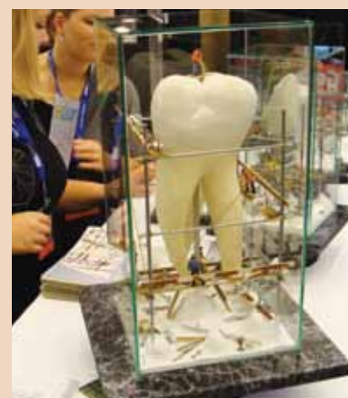
Attendees at a recent dental meeting check out the shadowboxes available from Art 4 Your Practice.