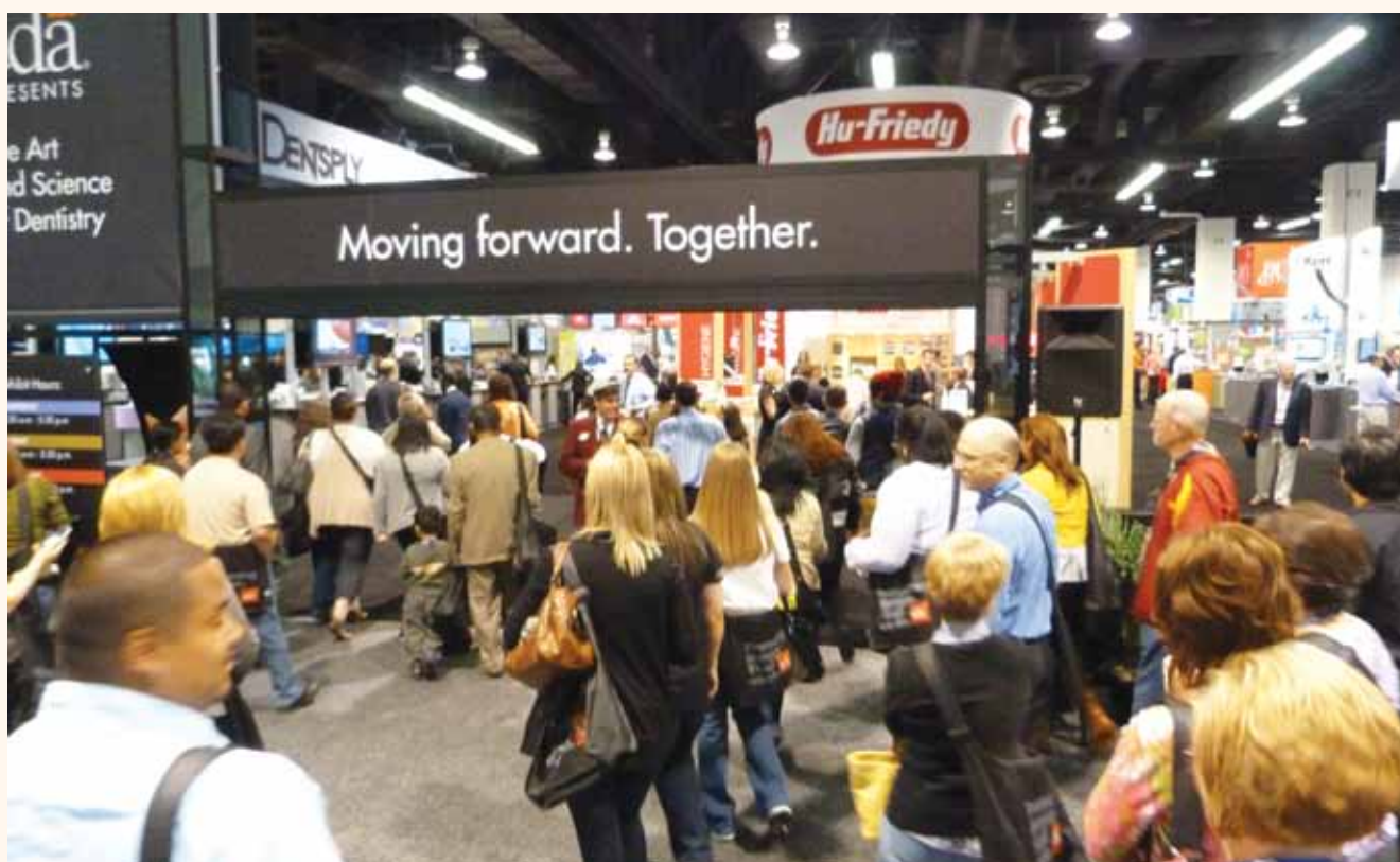
Attendees enter the exhibit hall at opening bell Thursday morning.

CDA exhibitors offer newest and most innovative products, services