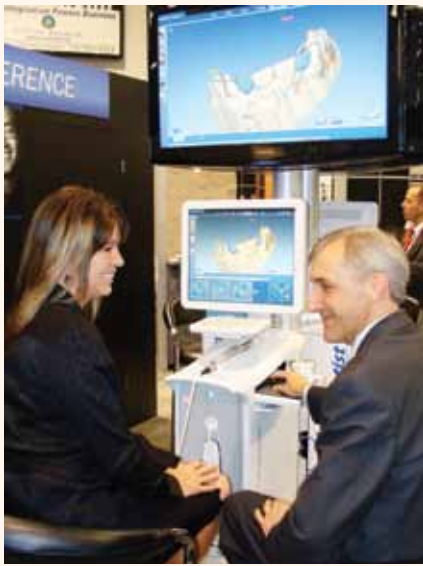
You can learn about D4D technology at the Henry Schein booth (Nos. 2018/2318).