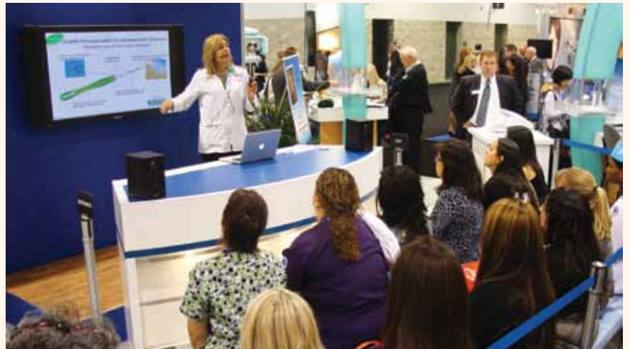
CDA attendees listen to a presentation at the Sunstar Americas booth (No. 1134).