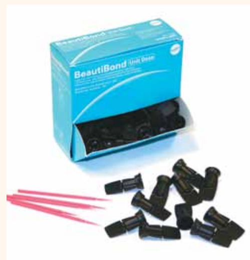
Shofu's BeutiBond.