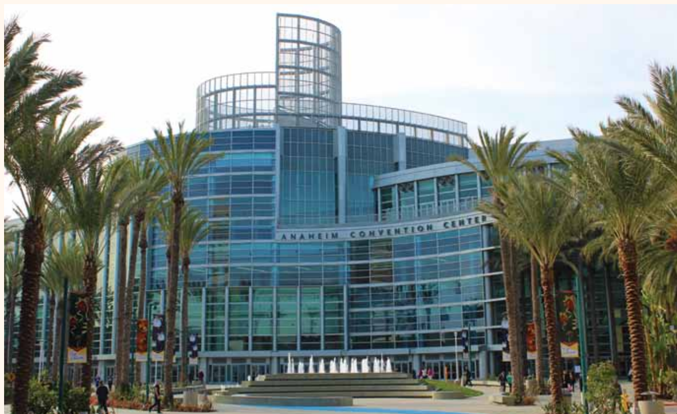
The Ocean Fountain in front of the Anaheim Convention Center.