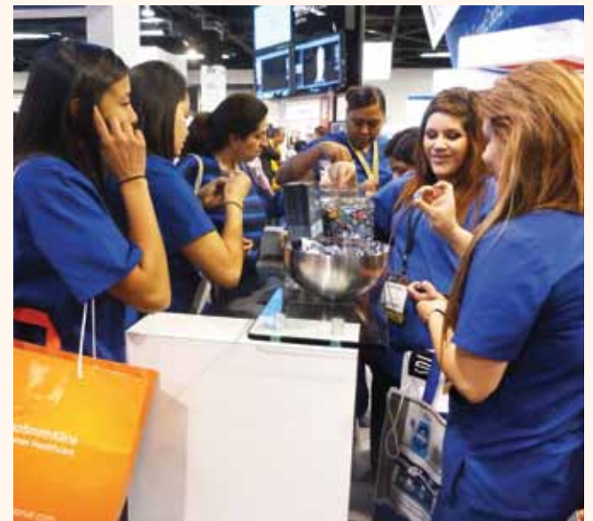
Dental students from Charter College in Long Beach admire the free dental buttons at the Henry Schein booth, No. 2424.