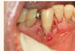
Fig. 5 Periodontal flap is closed with Ethicon #5 non-resorbable sutures.

of Dentistry, Chicago. He is the founder and president of the International Academy of Radiosurgery and is a fellow of the International College Of Dentists and a fellow of the American Academy of General Dentistry. Office: +377 93302850. Mobile: +377 (0)607933868. Web: www.dragoldstein.com , dragoldstein@monaco.mc .