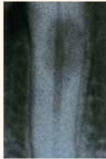
Fig. 1 Radiograph shows large area of internal resorbtion apical to the gingival crest.

A base of ZnPo4 cement was placed over the cone in the area of the resorbtion, followed by a well-polished macro composite filling. The periodontal flap was closed with Ethicon #5 non-resorbable sutures (Fig. 5). The #27 tooth is seen one-week post op in Fig. 6 and one-month post op in Fig. 7. Mr. H did not wish further treatment of the #27 tooth.