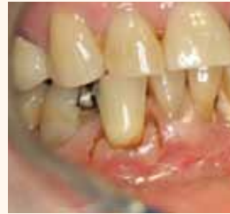
Figs. 2, 3 Radiosurgery provides access to area of internal resorbtion.