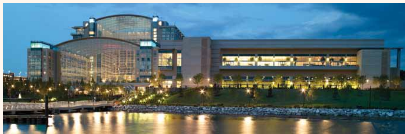
The Gaylord National Resort & Conference Center in National Harbor, Md., with its 18-story-tall climate-controlled atrium of glass and steel, is host site of the American Academy of Cosmetic Dentistry 28th Annual Scientific Session.