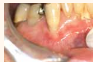
Fig. 7 One month post-op.