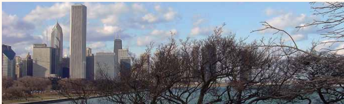
In addition to gaining access to hands-on courses and CE credit opportunities, attendees at the 2012 Chicago Dental Society's Midwinter Meeting get to explore one of the country's biggest and most fascinating cities.

New this year will be live treatment cases, broadcast on the exhibit floor each day of the meeting. Visitors to the meeting will be able to watch clinicians treat patients in a theater constructed on