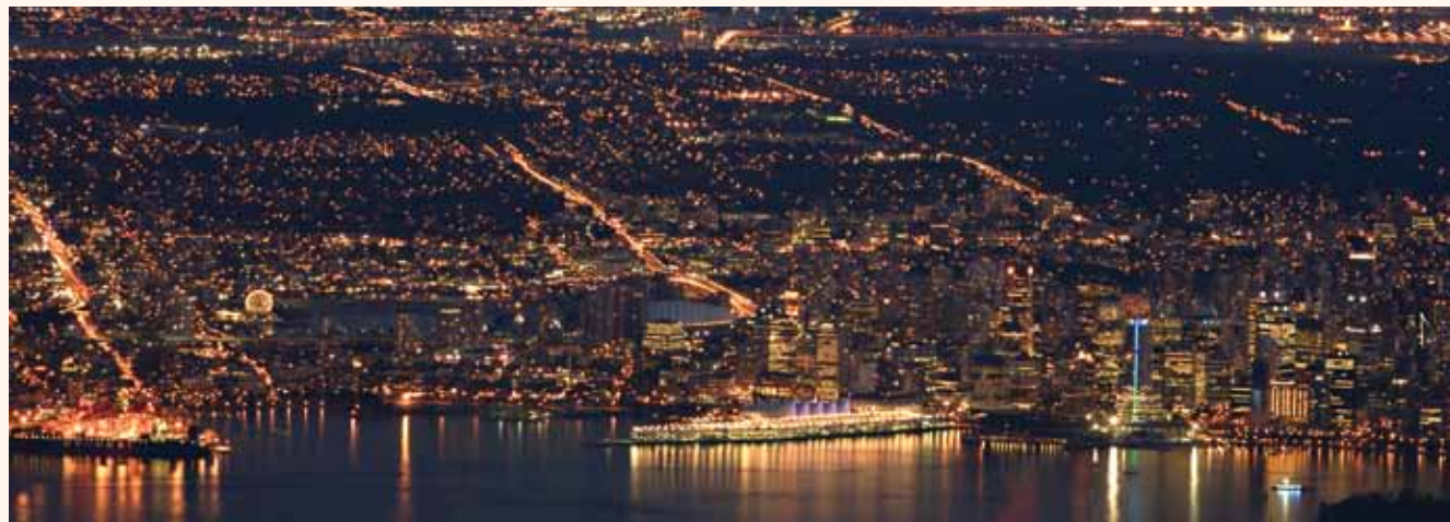
The Pacific Dental Conference combines all the excitement of Vancouver, named the world's 'Most Livable City' in 2011 by the Economist Intelligence Unit, with compelling educational opportunities for the entire dental team.

The Live Dentistry Stage is back on the exhibit hall floor, with demonstrations