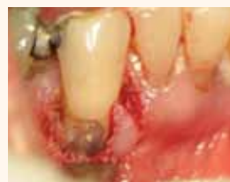
Fig. 4 Resorbtion is curetted, followed by root canal treatment with a gutta-percha cone and estesone sealer. Lamina dura at apex of the root is not defined.