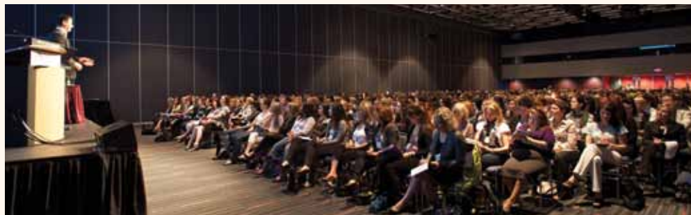
The JDIQ scientific program offers attendees a choice of more than 100 lectures in both English and French.