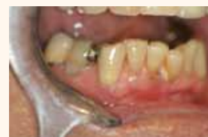
Fig. 6 One week post-op.