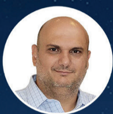
Antonis Chaniotis Greece