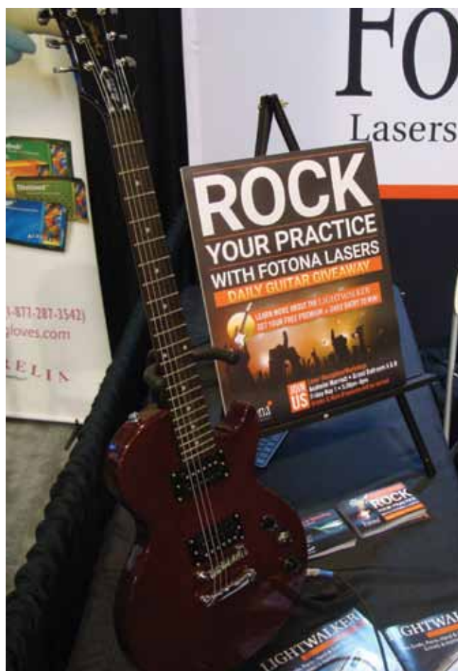
• They are giving away a guitar each day at Fotona (booth No. 1750). Visit them to learn more.