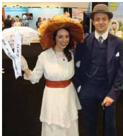
• Passengers from the Titanic are here to promote Supra-Gingival Dentistry seminars offered by the LA Institute of Clinical Dentistry and Ruiz Dental Seminars (booth No. 219). You don't want to 'sink below the surface,' the actors explain.