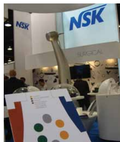
• To find NSK (booth No. 360), look for the giant handpiece.