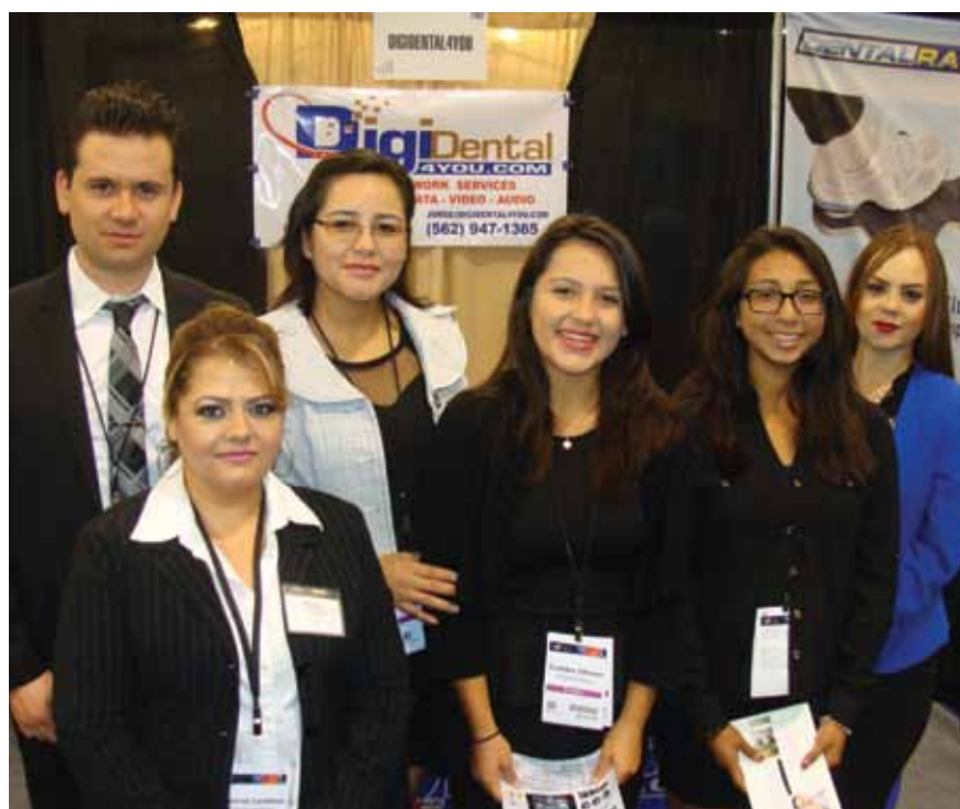
• The staff of DigiDental4U (booth No. 2352).