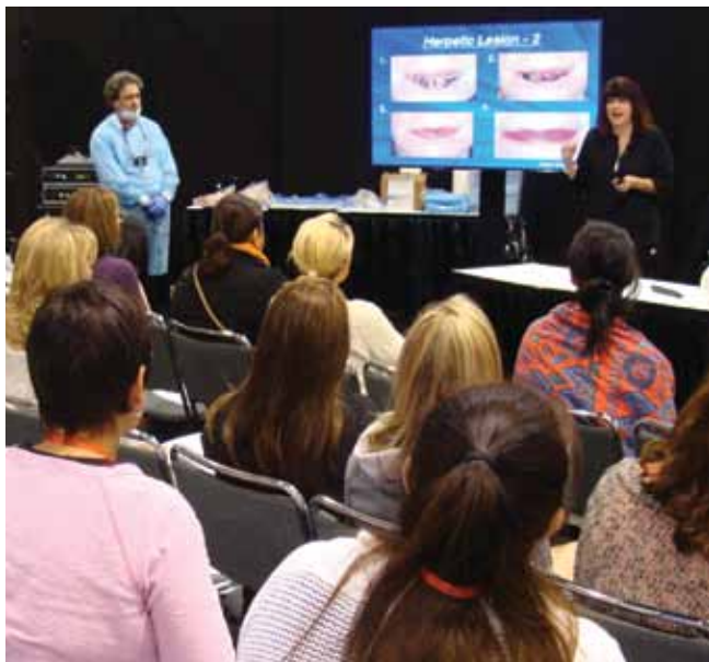
• Meeting attendees attend a laser workshop Friday morning.