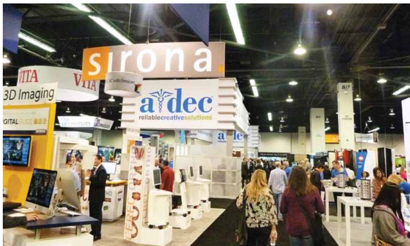
• Attendees stream through the many exhibit aisles of CDA Presents.