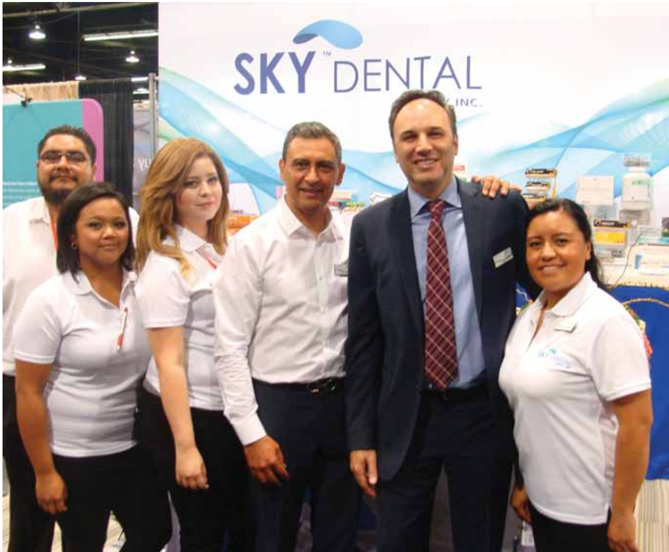
• The team at Sky Dental Supply (booth No. 767).