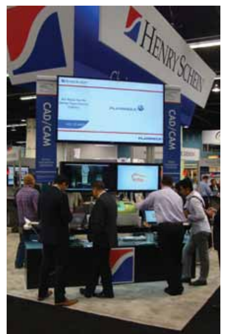
• Meeting attendees stop by Henry Schein (booth No. 1470) to learn more about E4D digital technology.