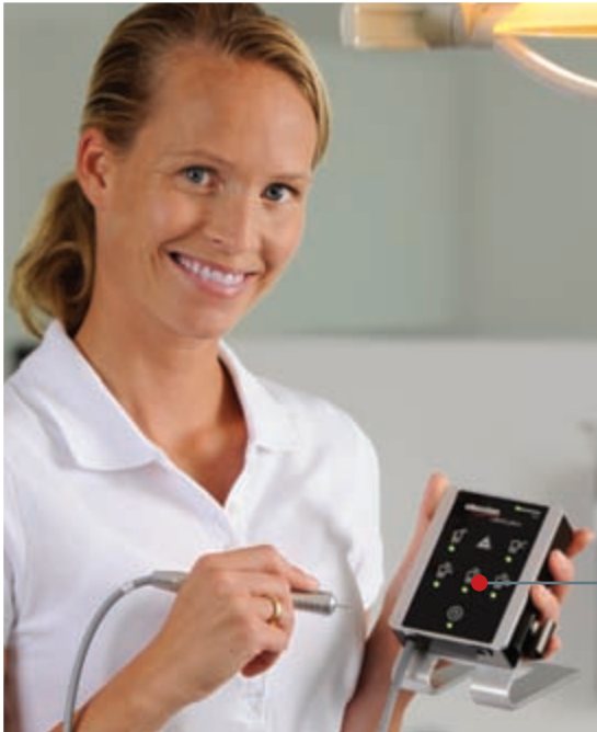
Just 115 x 90 x 28 mm: the claros pico®

“elexxion’s latest development is absolutely brilliant.