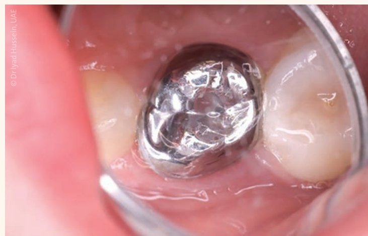
Photo showing a preformed metal crown fitted with the Hall technique.

"Crowns are recommended for restoring primary molars that have had a pulp treatment, are very decayed or are badly broken down.