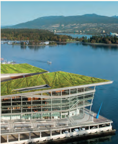
The Vancouver Convention Centre, on Vancouver Harbor, is host site of the 2016 Pacific Dental Conference.