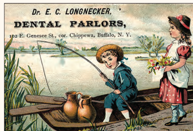
A virtual museum image from the online exhibit 'Business Cards of the Victorian Dentist,' viewable at www.dentalmuseum.pacific.edu .