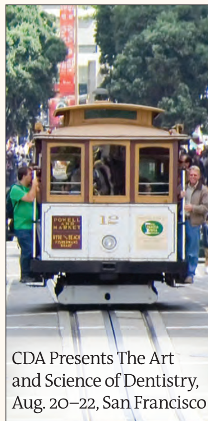
CDA Presents The Art and Science of Dentistry, Aug. 20-22, San Francisco

San Francisco's famed cable cars are just blocks away from the Moscone Center, host to the California Dental Association's northern version of its two main annual meetings. The event features a wide array of courses, lectures and workshops — and more than 400 companies displaying dentistry's latest products and services.