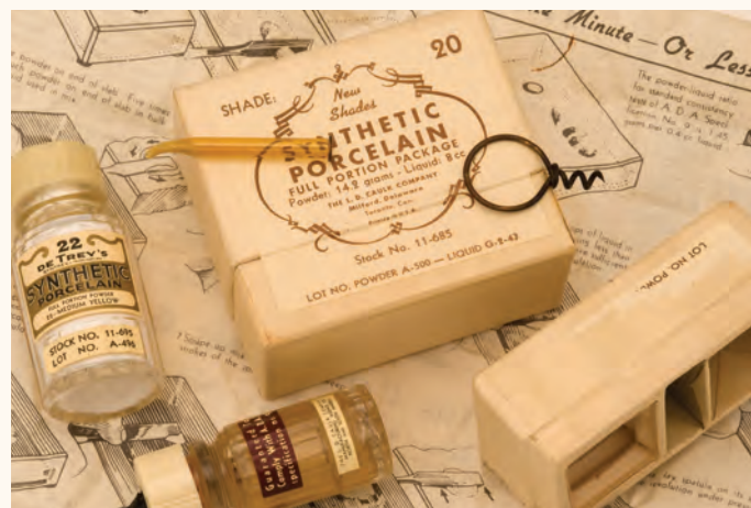
Virtual museum exhibit image, De Trey's Synthetic Porcelain Powder kit (circa 1930), used for artificial teeth, complete dentures, facings, inlays, veneer crowns and other restoration work.