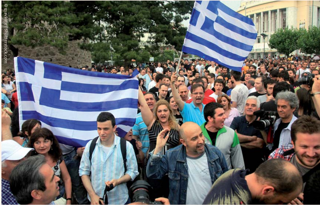
Photo showing protesters in Thessaloniki. The crisis has left Greece in turmoil.