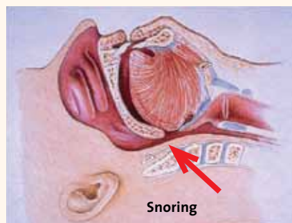
• Fig. 1 : This is what happens to those who suffer from sleep apnea: The tongue completely blocks the airway. • Fig. 1 : Voici ce qui arrive à ceux qui souffrent d'apnée du sommeil : la langue bloque complètement les voies respiratoires.