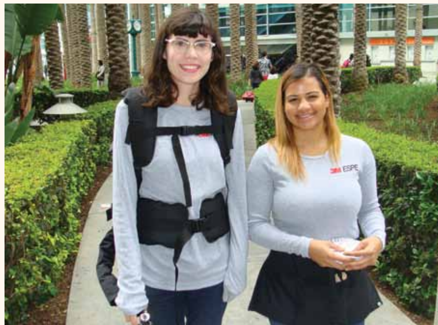
These ladies from 3M ESPE (booth No. 402) were dispensing coffee, product information and smiles on Friday morning just outside the convention center.