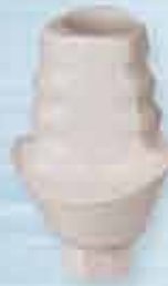
Custom impression coping included