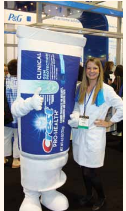
Fun! You can get your photo taken with a giant tube of toothpaste at Crest Oral-B (booth No. 1166).