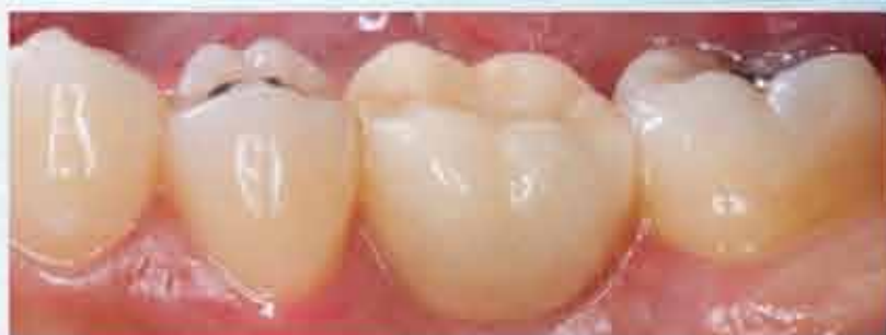
Buccal view of final restoration at delivery