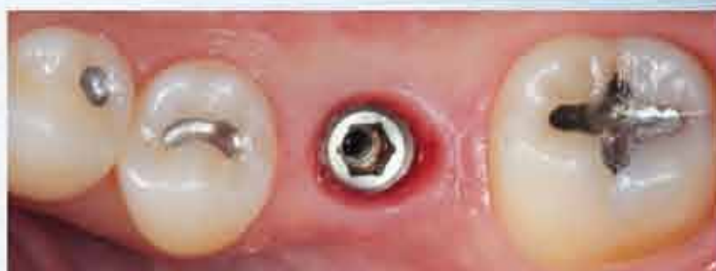
Contoured soft tissue sulcus after healing