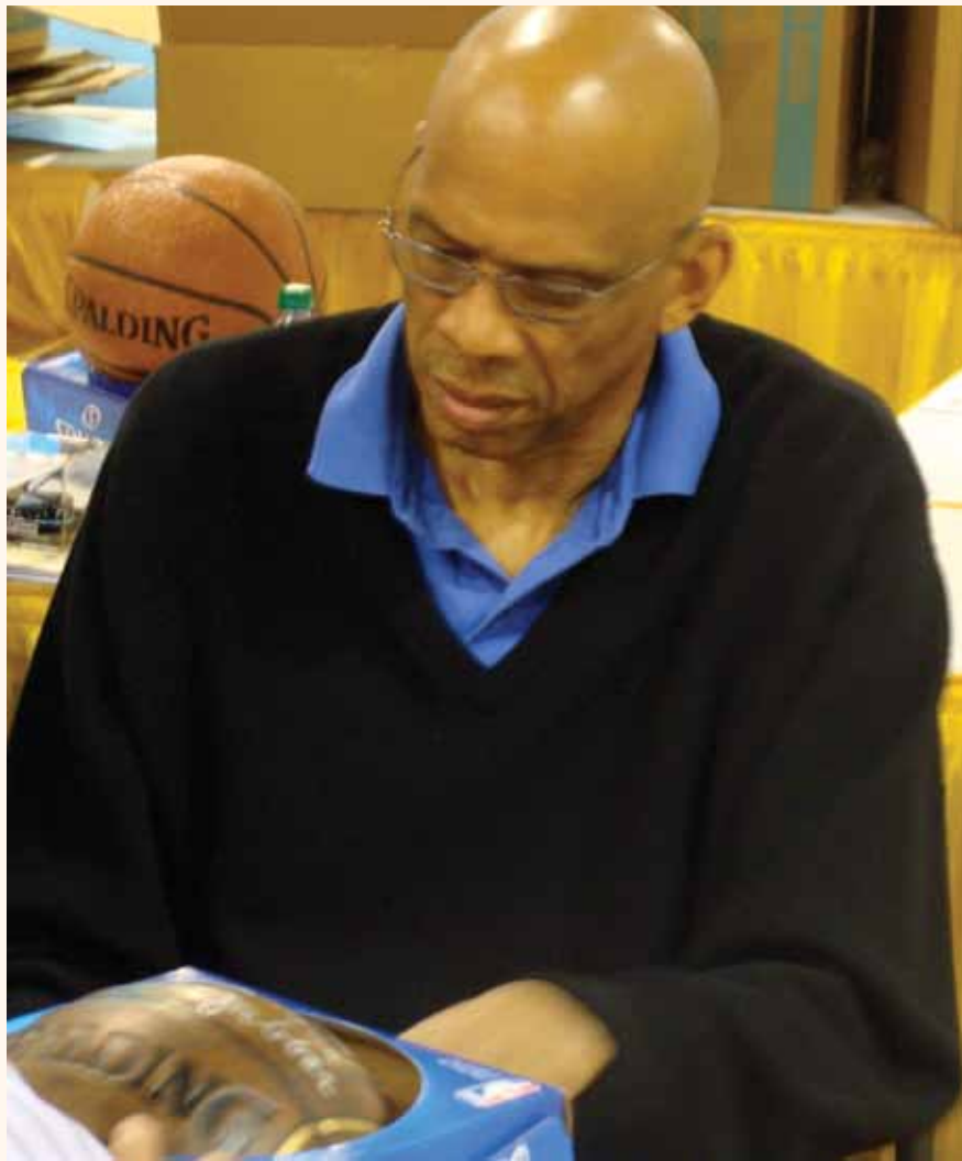
NBA legend Kareem Abdul-Jabbar, who is currently appearing in the reality show 'Splash' on ABC, signs basketballs Friday at Glove Club (booth No. 832).