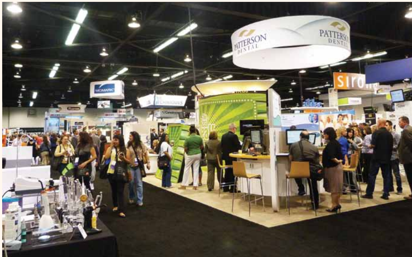
CDA attendees can visit more than 570 exhibitors offering a bevy of products and technologies here at the Anaheim Convention Center.