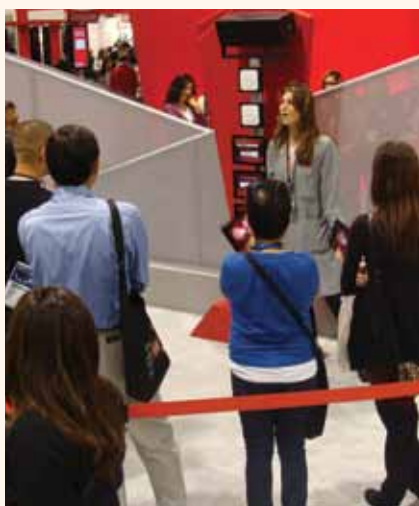
Meeting attendees learn about products for oral hygiene at Colgate (booth No. 1316).