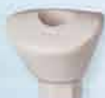
Custom healing abutment included