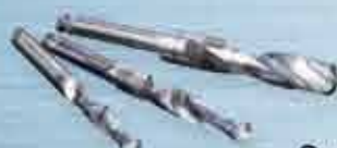
Surgical drills and Inclusive® Tapered Implant included