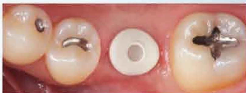
Inclusive custom healing abutment at implant placement