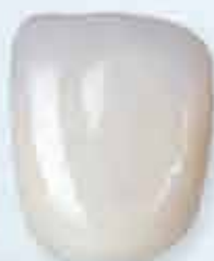
Final BruxZir® or IPS e.max® crown included