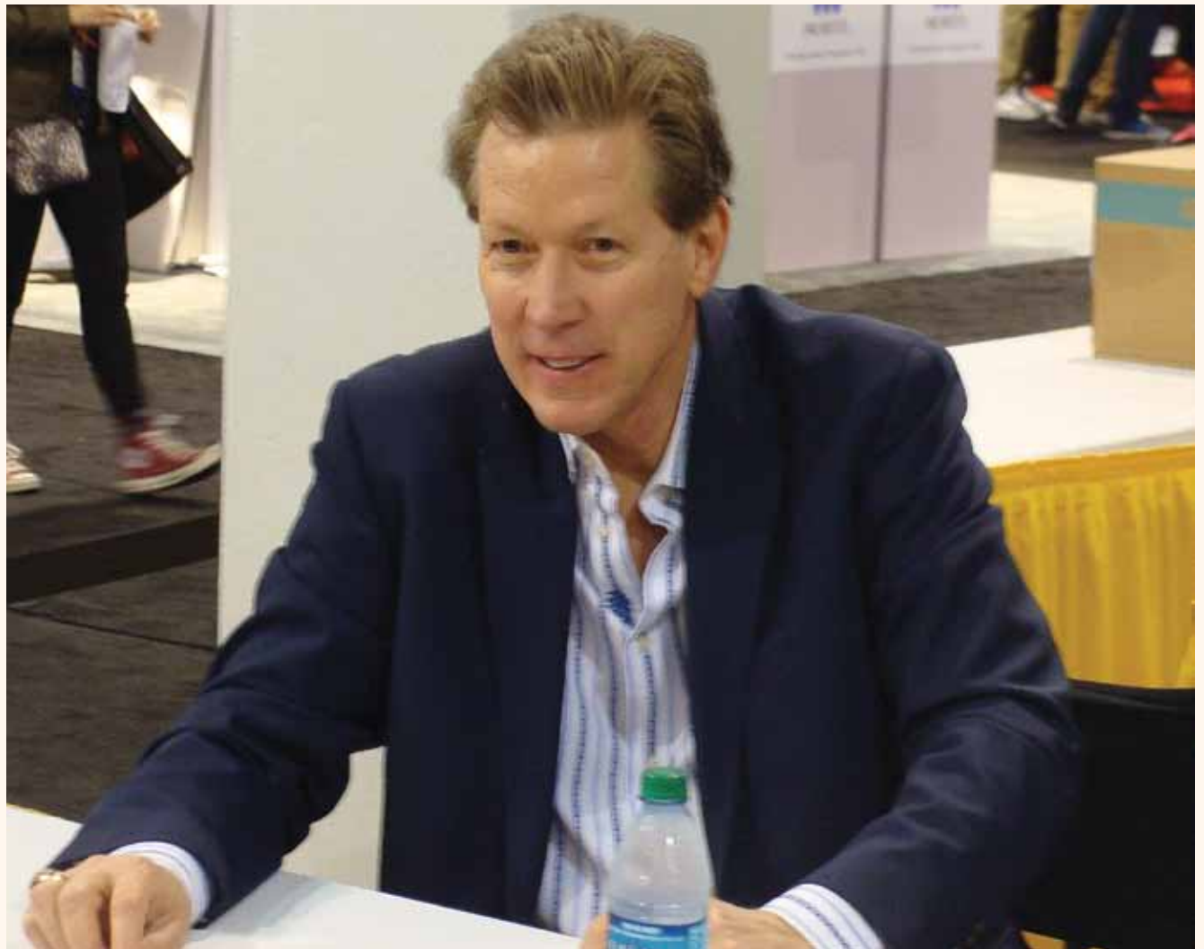
Retired MLB pitching ace Orel Hershiser at the Glove Club (booth No. 832).