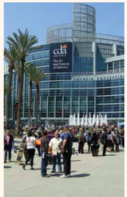
For many CDA attendees, the area just outside the convention center is a great place to grab a bite or take a break.