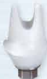
Final Inclusive® Custom Abutment included