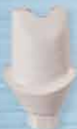
Custom temporary abutment included