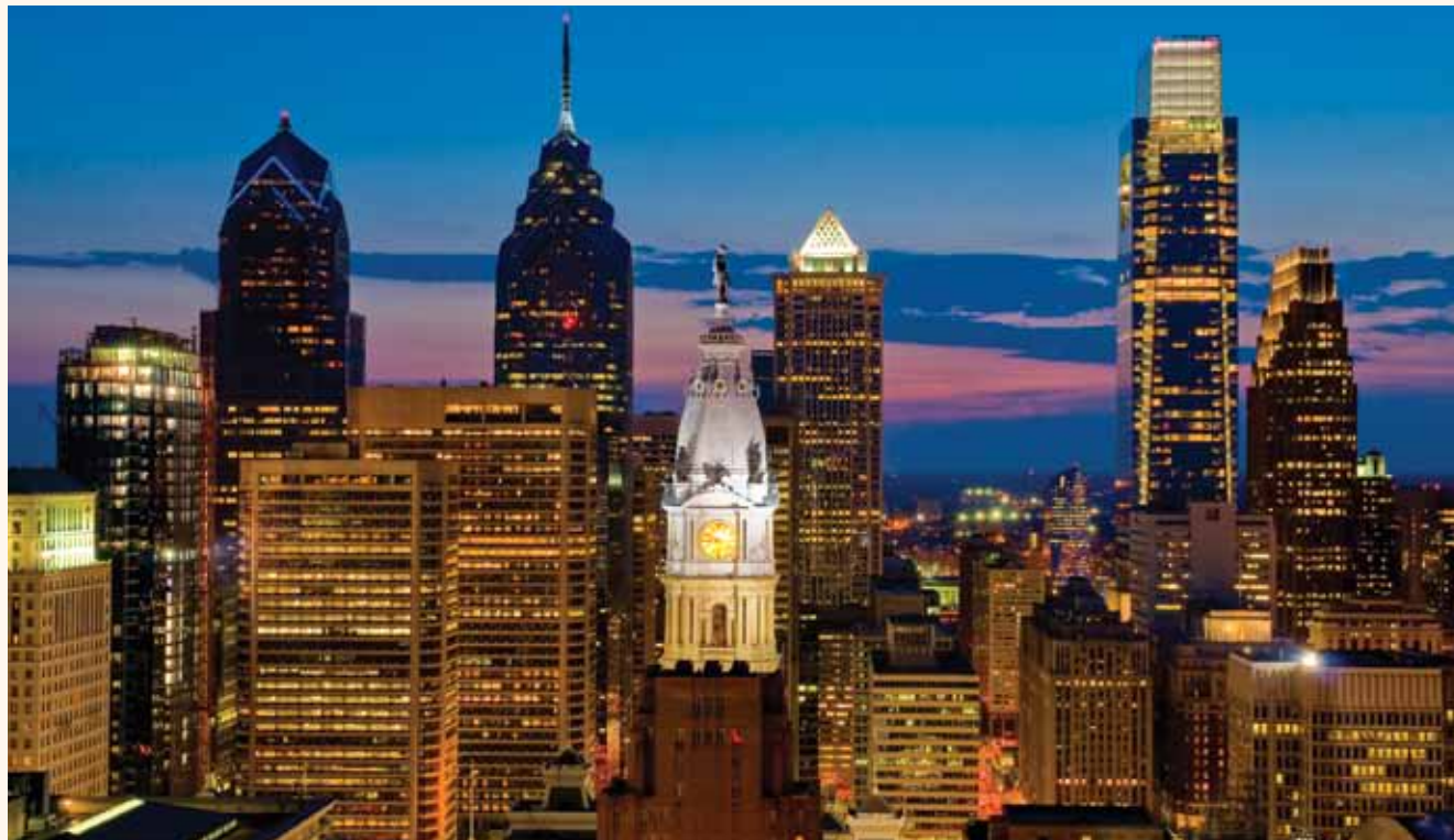
An evening sky view of Philadelphia highlights the contrast of new and old standing side by side. In the photo's center is the bronze statue of the city's founder, William Penn, sitting on top of the 511-foot-tall City Hall Tower with its lighted clock. The newest addition to the skyline, the Comcast Center on the right, is the tallest building between New York and Chicago.

Exhibit hall hours are 4:30 to 7:30 p.m. Thursday, June 21, with an all-attendee welcome reception from 5:30 to 6:30 p.m. The next day, Friday, June 22, the exhibit hall opens at 10 a.m. and closes at 6:30