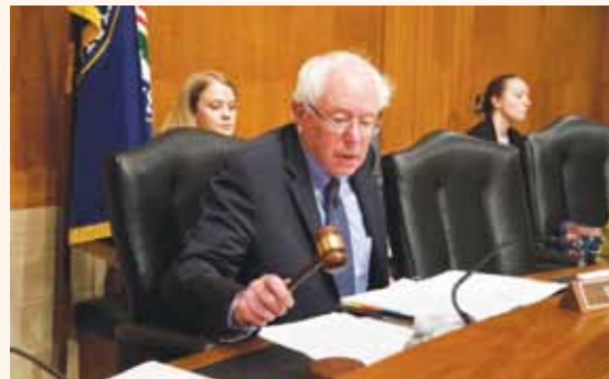
Sen. Bernard Sanders, I-Vt., chairman of the U.S. Senate Subcommittee on Primary Health and Aging, leads the hearing on "Dental Crisis in America: The Need to Expand Access."