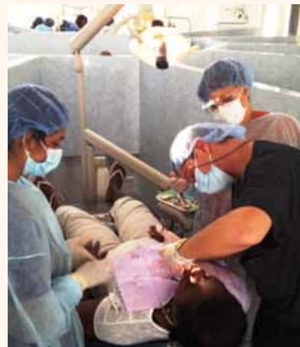
The AAIP/ADIS course is tax deductible and worth 35 hours of dental continuing education credits.

(Source: The American Academy of Implant Prosthodontics)