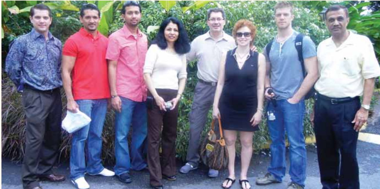
Participants at the AAIP/ADIS implant seminar, Kingston, Jamaica, March 12–16.