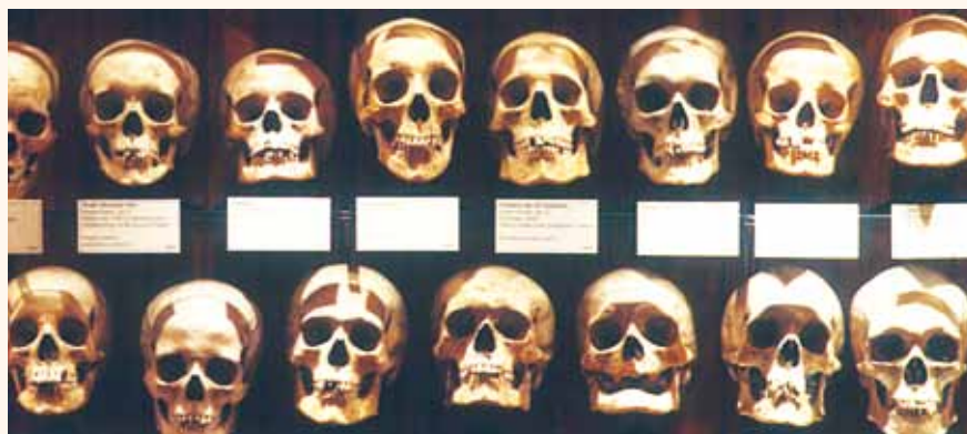
Known as the 'wall of skulls,' this collection of 139 skulls is found in one of the most unusual museums anywhere — the Mütter Museum of the College of Physicians of Philadelphia. The museum features specimens of anatomy and pathology and historic medical instruments, including a few dental and oral-surgery items. For details, call (215) 563-3737 or visit the website, www.collphyphil.org.

Philadelphia, America's birthplace, has no end of historical sites worthy of repeat visits, whether the Liberty Bell Center, Independence Hall, Franklin Square, National Constitution Center or any number of others. But for medical-type folks, the can't-miss destination is the Mütter Museum of the Philadelphia College of Physicians. It boasts one of the world's most unusual collections, featuring more than 20,000 medical anomalies and curiosities, historic medical instruments and anatomical pathologies.