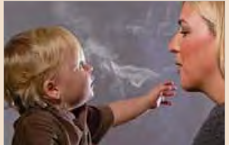
Children are vulnerable to the affects of sccondhand smoke

not only will you stop damaging your body, you will stop damaging those around you.” DT