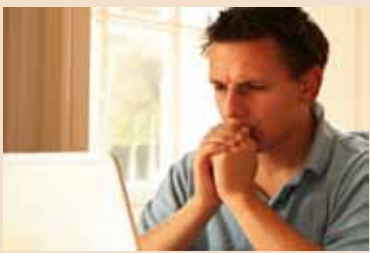
Online to better health?

The NHS Commissioning Board (NHS CB) has announced plans to help up to 100,000 more people to use the internet to improve their health.