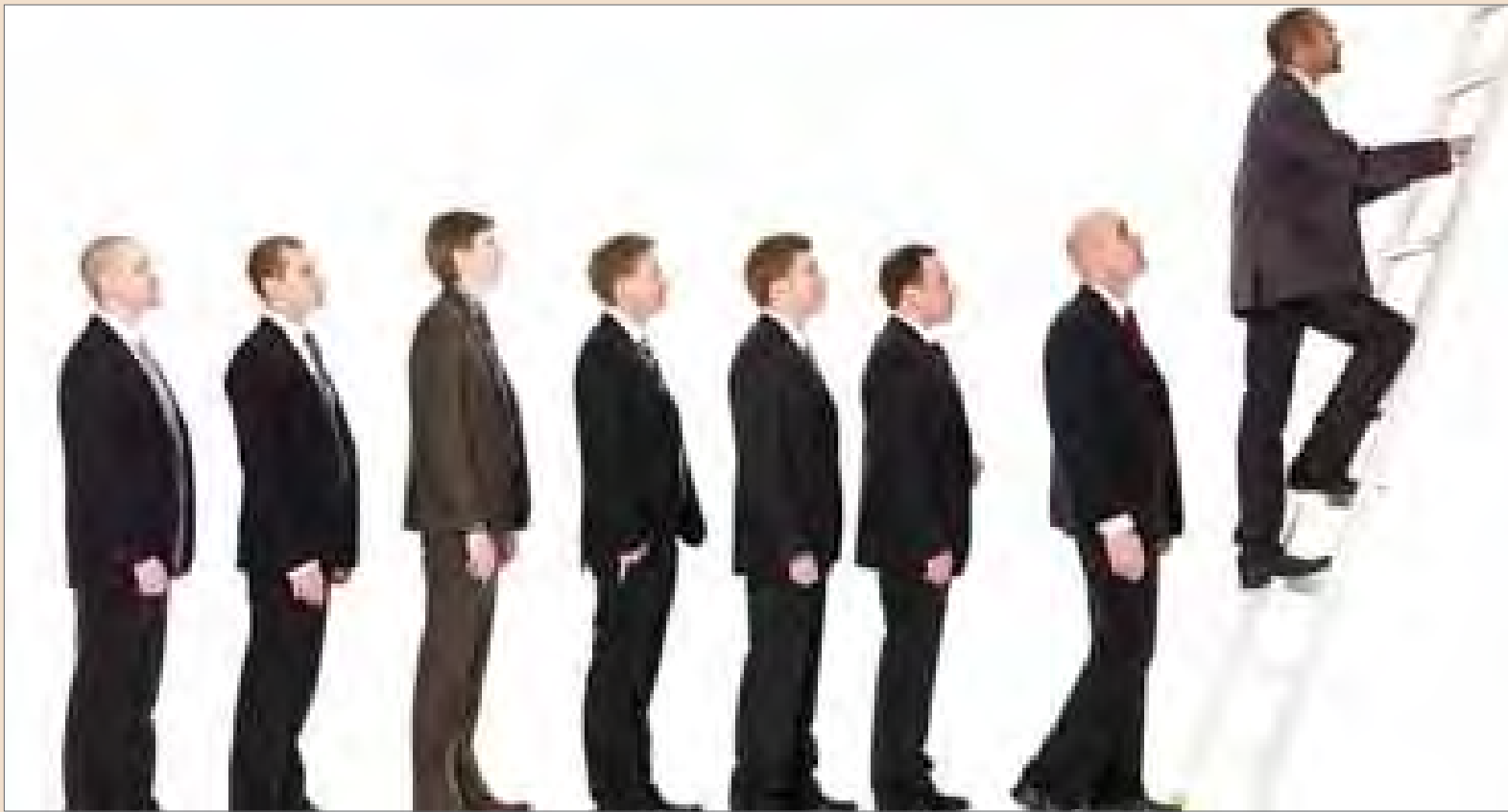
Climbing the skills ladder

The CASPER campaign began in June 2012 with a meeting of 12 interested parties at Aston University Business School. The aim of the meeting was to form a Steering Group to highlight the need for clear guidance on the standards of professional education required to enable dental professionals to meet regulatory standards for quality of care and patient safety.