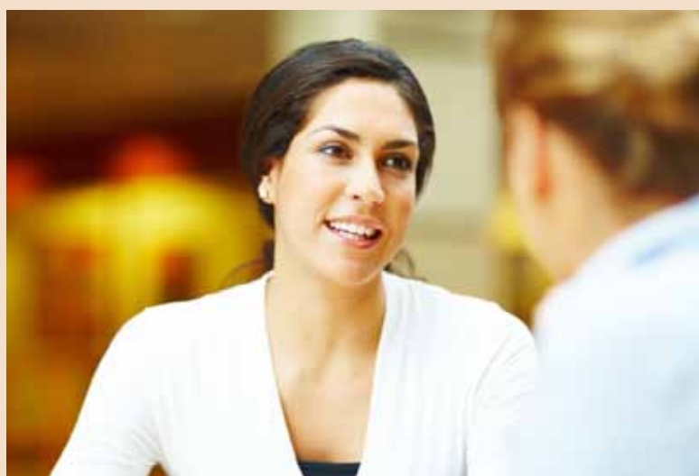
Personal recommendations are key

More than 28 million people in the UK chose their current dentist through word of mouth, according to new research.