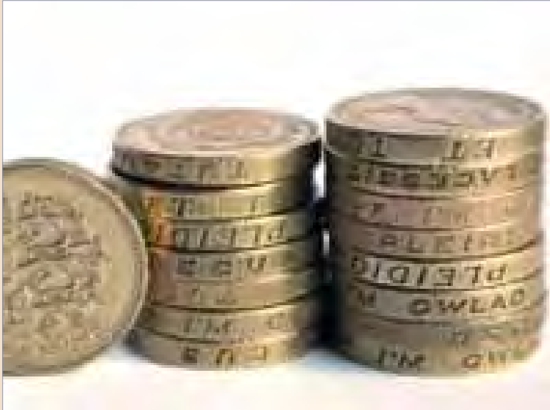
BDA warns of fiscal pressure

A Government decision to award general dental practitioners in England an uplift to their funding of 1.5 per cent for 2013/14 will do little to relieve the increasing pressure on high street dentists, the British Dental Association (BDA) has warned.