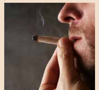
Another risk from smoking