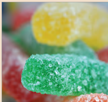
Sugar taxes have been suggested to curb and control the consumption of sugar

In the past 50 years sugar consumption throughout the world has more than tripled and according to US experts, the sweet granule is just as damaging and addictive as alcohol and tobacco and should be regulated.