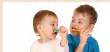
Dental packs will be given to children under five

So far around 900 dental practices across the country are involved in the scheme. DT