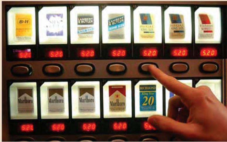
Wales introduces ban on cigarette vending machines after it emerged that 10 per cent of 11-15 year-old smokers used them

A ban on cigarette vending machines came into force in Wales on 1st February and is soon to be issued in Northern Ireland on 1st March.