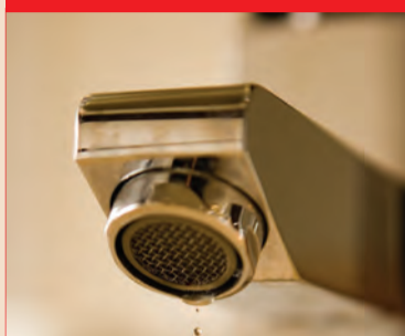
Save water! NSM takes on new challenge