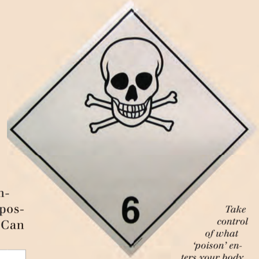
Take control of what 'poison' enters your body

been sacked years ago, especially if you drive to work every day. Imagine then how hard it can be to accept blatant corruption and injustice in your own supposedly civilised country. Can