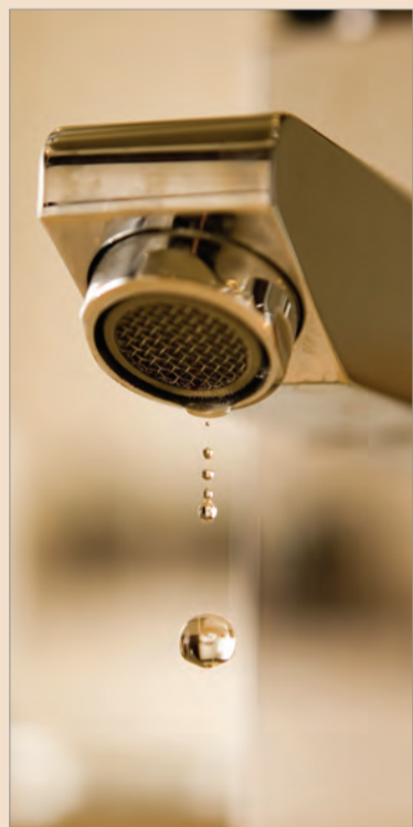
Turning off the tap when brushing your teeth could save up to 12 litres of water

Water consumption in the UK is up 30 per cent per person since 1970 and it is feared that if the trend isn't reversed there will come a time when the demand just won't be able to be met. This will have a devastating effect on the UK's rivers, lakes and stream levels, animal and plant life so this year, for the first time, the National Smile Month Campaign is promoting responsible water use.