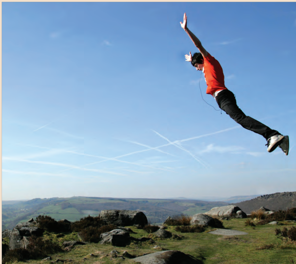
Make the most most out of this world and life

writing "letters to the editor" or to your MP as an individual will do nothing, and as the situation worsens your dissatisfaction will only grow. It