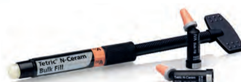
Tetric® N-Ceram Bulk Fill sculptable

* Compared with Tetric® N-Flow and Tetric® N-Ceram Data available on request.