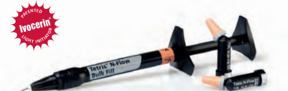
Tetric® N-Flow Bulk Fill flowable