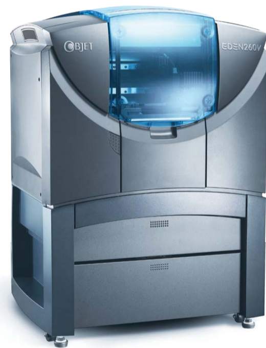
Objet Eden260V 3D Printer