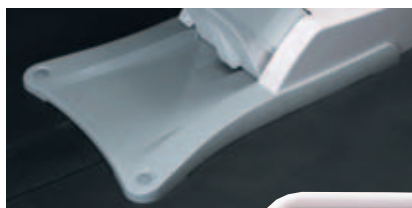
Clesta-II E Holder type