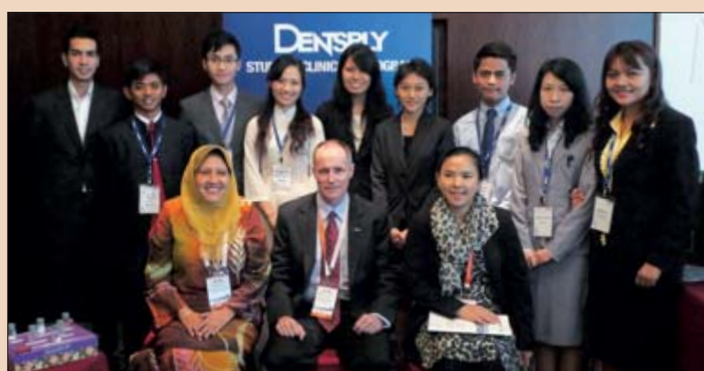
Group photo of participants of this year's Student Clinician Program conducted by DENTSPLY Asia during the annual meeting of the International Association for Dental Research South-East Asian Division in Hong Kong. ▶ ASIA NEWS, page 3

Approximately 1,200 unidentified human bodies are found in Japan each year. In 2011, this number increased significantly owing to devastations caused by the Tōhoku earthquake and the resulting tsunami. While 10 per cent of the victims were identified by their teeth, according to figures of the Japan Dental Association, forensic dentistry experts in Japan lack experience and are too few with only half a dozen experts available in some of the country's provinces. DTI