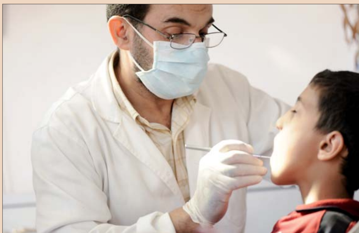
Primarily children are supposed to benefit from the new scheme.

Under the CDDS, patients with chronic illnesses and complex care needs were able to claim benefits of AUS$4,250 (US$4,440) for dental treatment by a private dentist when referred by a doctor.