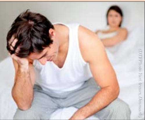
Erectile dysfunction affects about 150 million men worldwide.