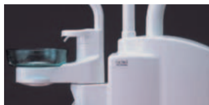
Clesta-II E Rod type

The Clesta II epitomizes Belmont's reputation for innovation, style, practicality and reliability. Technologically advanced and superbly engineered it represents a new generation of dental systems.