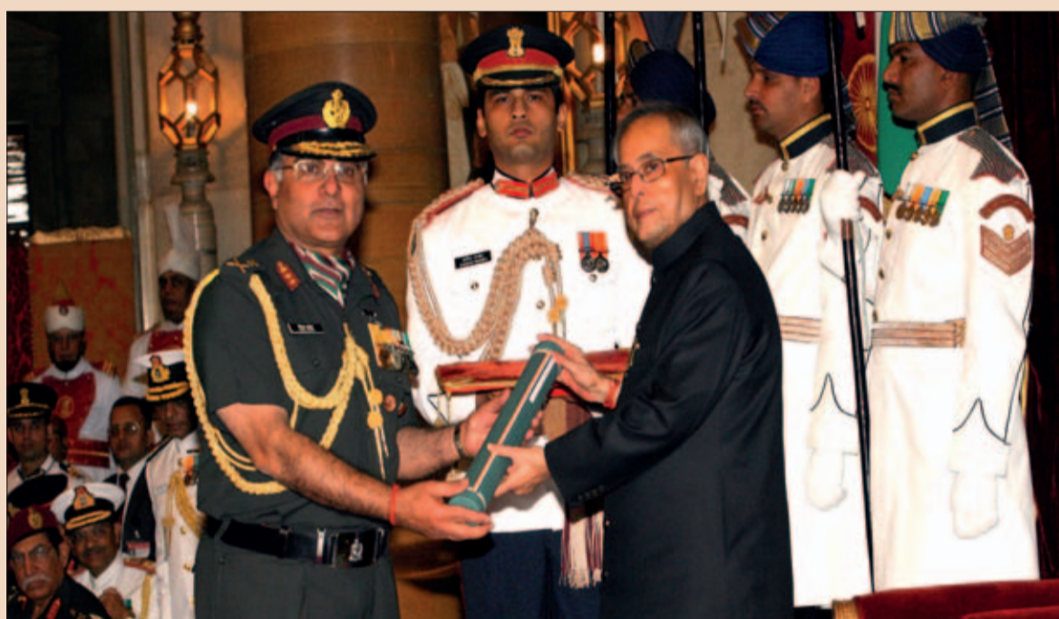
Investiture 2014 Scroll of Honour presented to Lt. Gen. Vimal Arora by the President of India

His sojourns abroad include deputation abroad while being in Air Force; i.e. Deputation to the