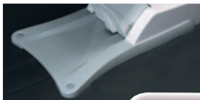
Clesta-II E Holder type