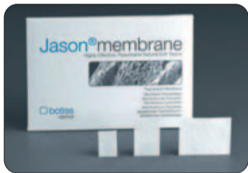
Cerabone® Natural Bovine Bone