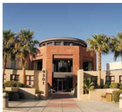
• The Las Vegas Institute for Advanced Dental Studies in Las Vegas.

The Core I program at LVI is the first step on that journey. That's why when you call, we answer the phone: "LVI, where lives are changing daily!"