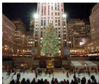
• Ice skaters go in graceful circles beneath the gilded statue of Prometheus and the glittering Christmas tree at Rockefeller Center.

It doesn't matter whether this is your first time in New York or if you come here every year. There is always something new to discover. Turn the pages for some ideas.