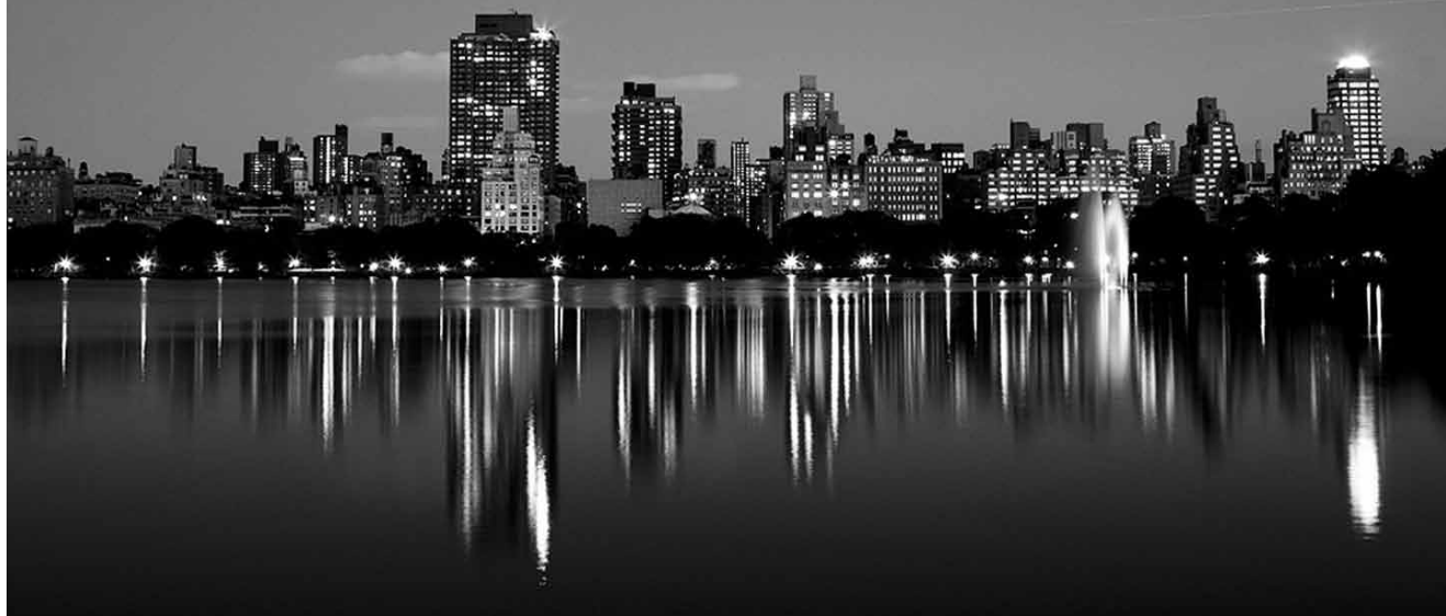
• The New York City skyline.