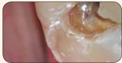
Fig. 4: Case No. 4, #31, severely cracked tooth with no pain.

The four simple cases presented here illustrate how using multiple magnifications allows the general dentist to exceed his or her ability to see beyond one's eyesight or loop magnification.